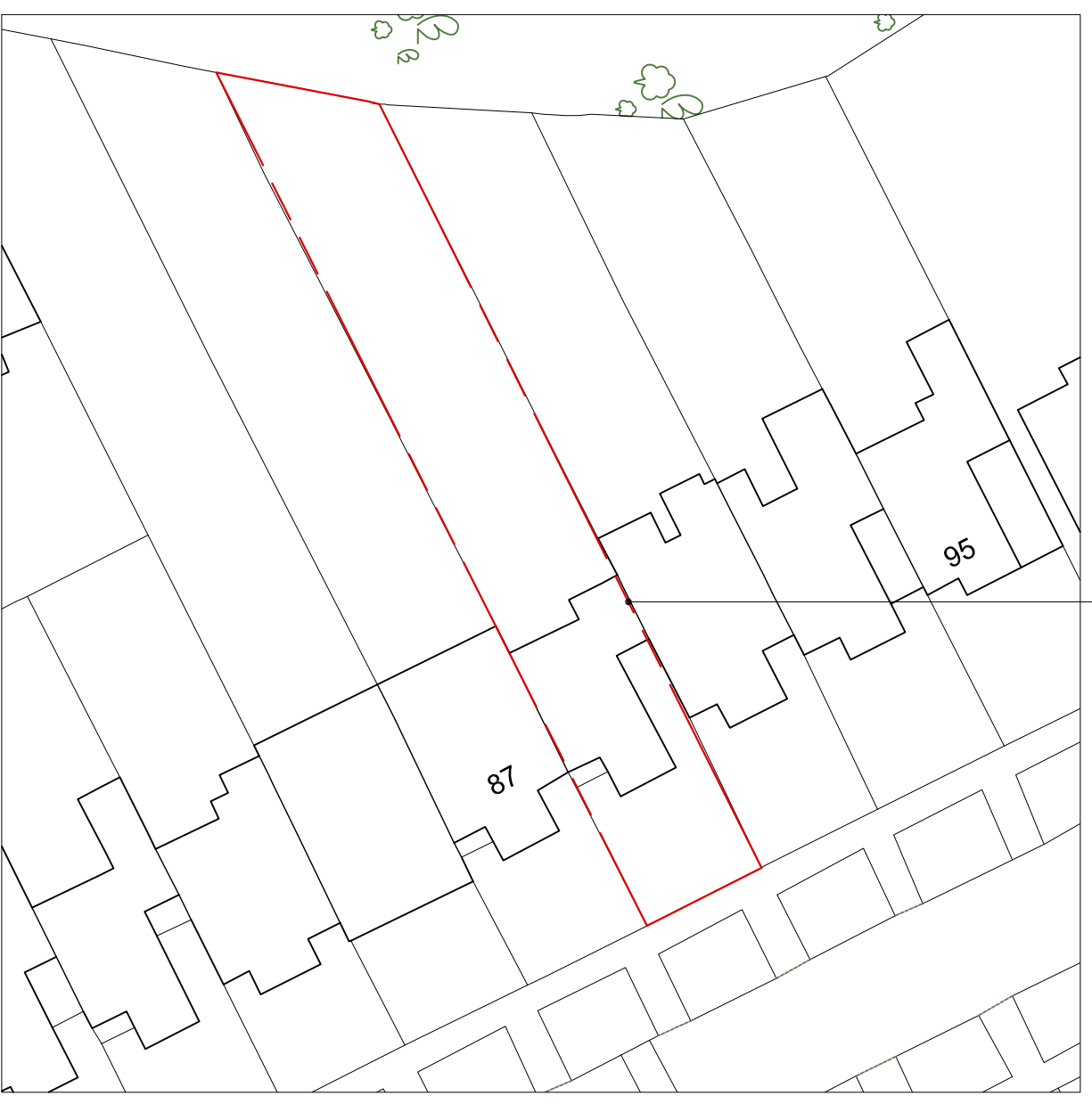
02 SITE PLAN scale 1:500