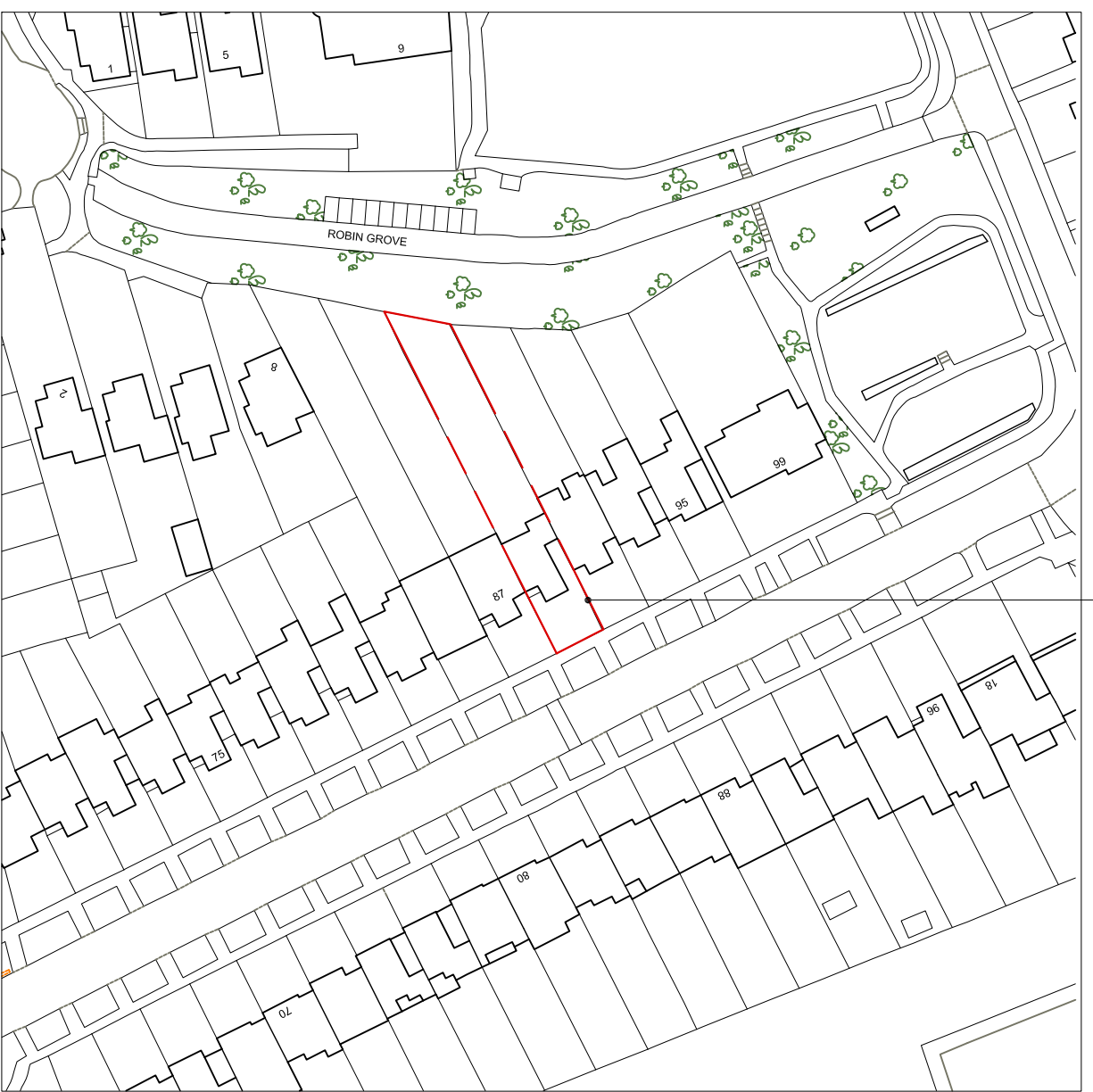
01 LOCATION PLAN scale 1:1250