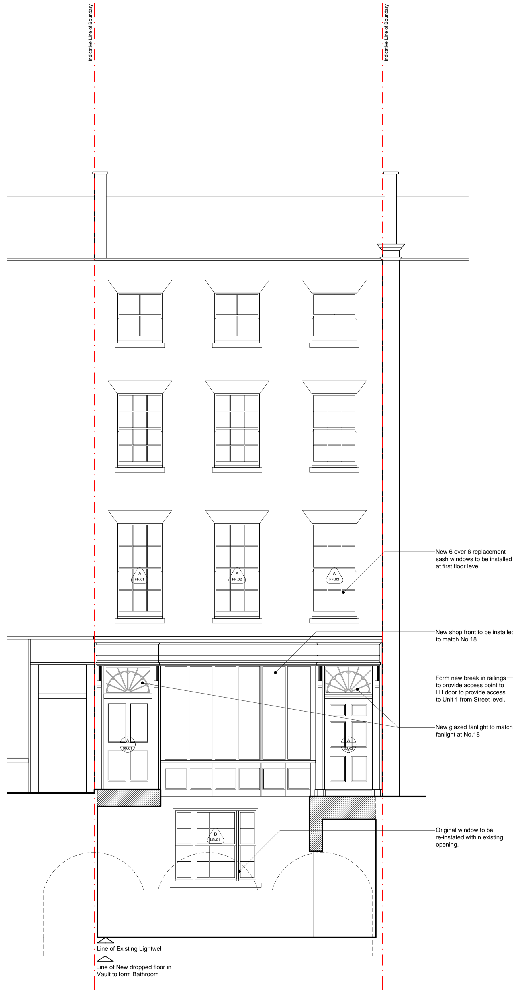
Proposed West Elevation Section_BB