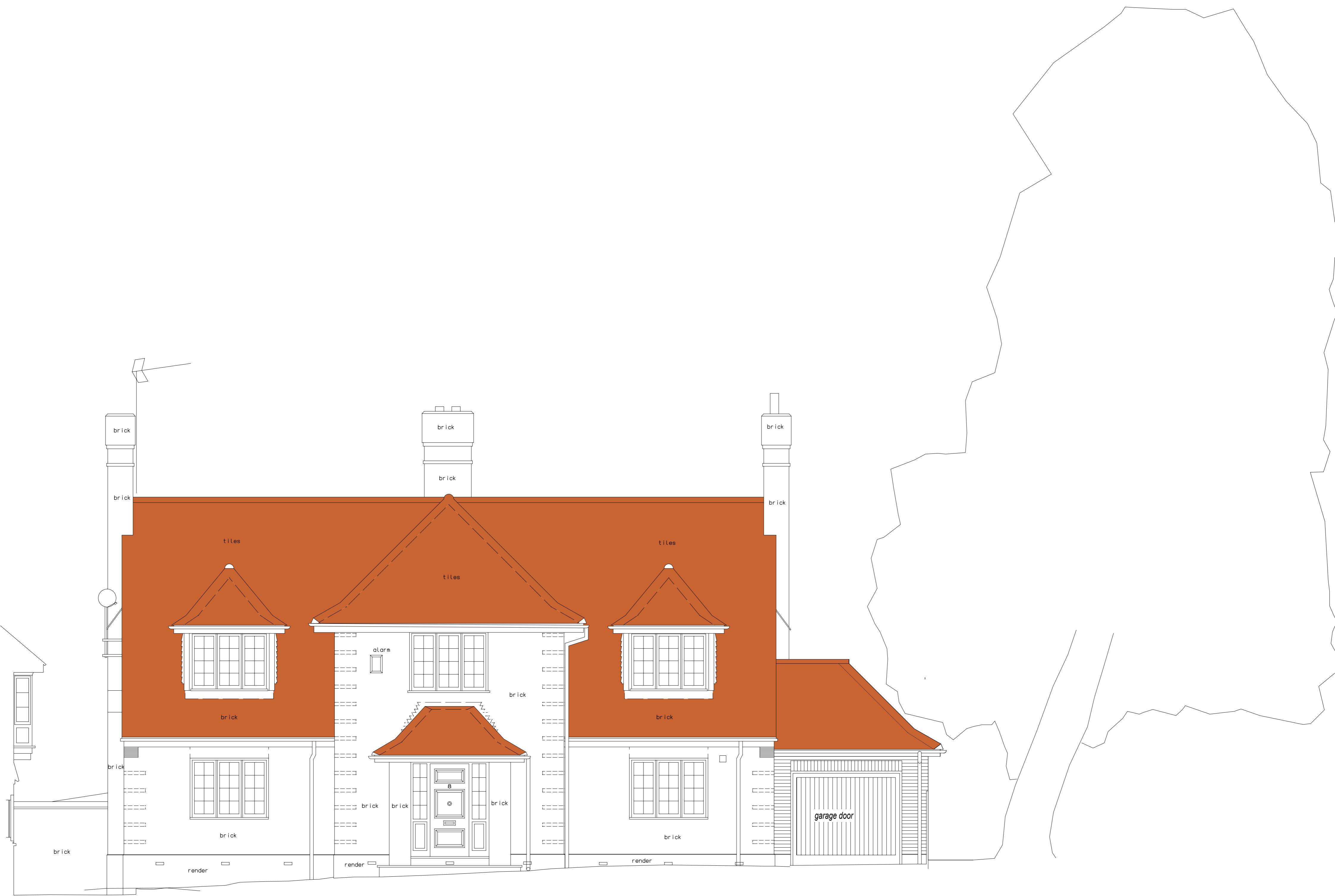
SOUTH ELEVATION with pitched roof garage extension