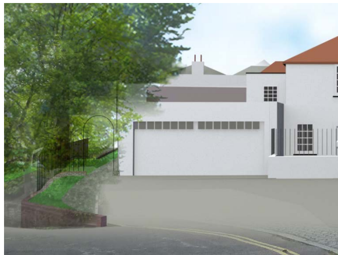
Fig.6 Visualisation of approved scheme with proposed railings.

The proposed new fence will rationalise the boundary as shown on the land registry map, pedestrian access and security to the premises. The submitted proposals are considered not to harm the character and appearance of the listed building, nor harm any of the original fabric of the listed building.