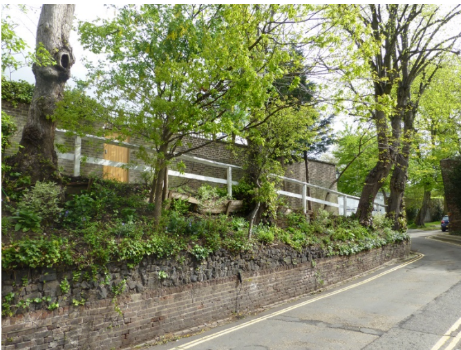
Fig.1 Existing Southern Boundary Wall alongside Admiral's Walk.

The existing boundary wall alongside Admiral's walk has been damaged by a mature lime tree and has been defined by the LBC as a dangerous structure. Repair of this boundary wall is already approved as part of the 2015/4485/P & 2015/4555/L.