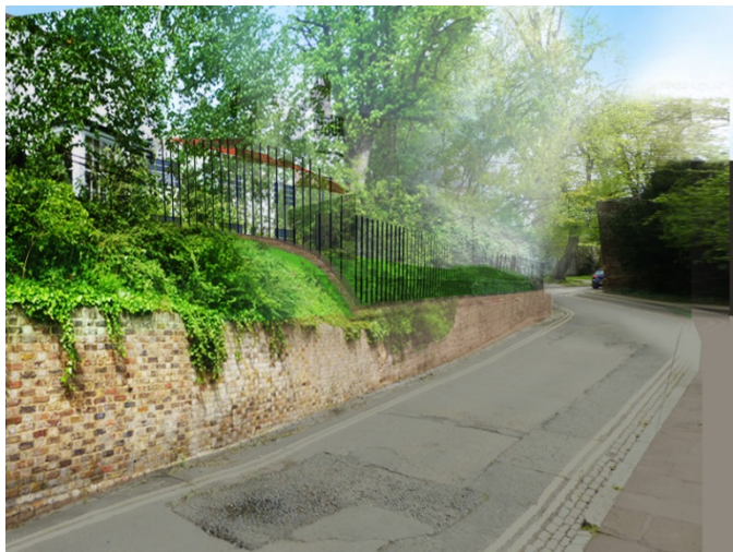
Fig.5 Street level view from Admiral's walk of proposed railings.