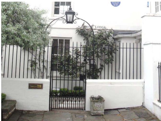
Fig.3 Existing Railings to the front of Grove Lodge.

The proposal is to repair the retaining brick boundary wall and install a wrought iron fence in the same style as those on the front of Grove Lodge and Admiral's House (Fig.3). The new metal railings would be in keeping with the existing metal fencing surrounding Terrace Lodge (Fig.4). The proposed black painted metal railings will blend in to the surrounding landscape much more sympathetically than the previous wooden fence (Fig.5).