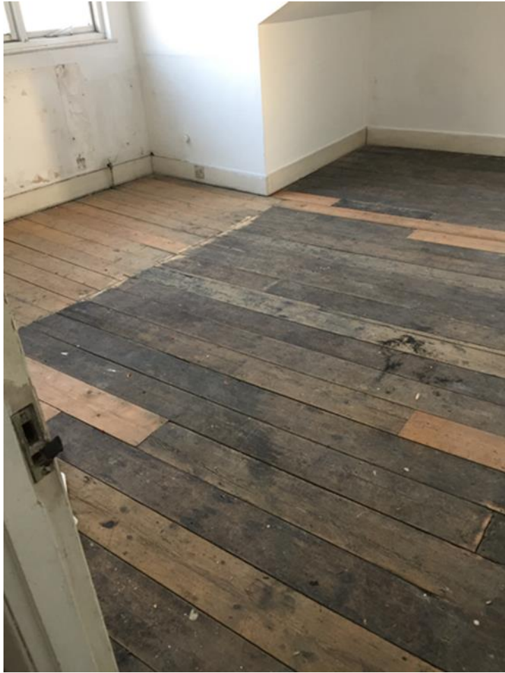
1 Provost Road, NW3 4ST Second Floor Bedroom 3