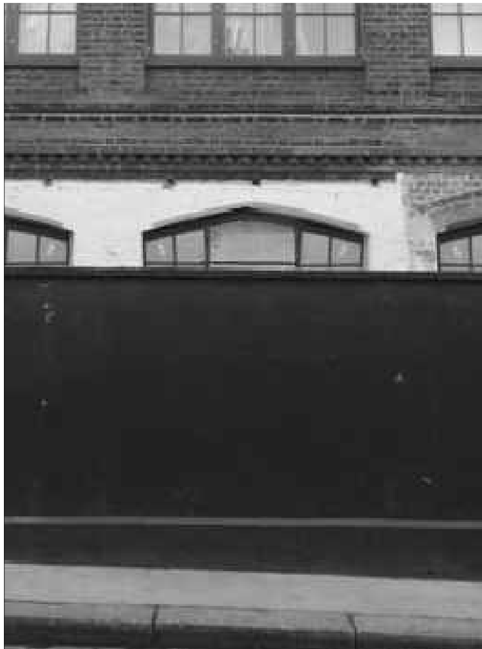
Existing Boundary Wall