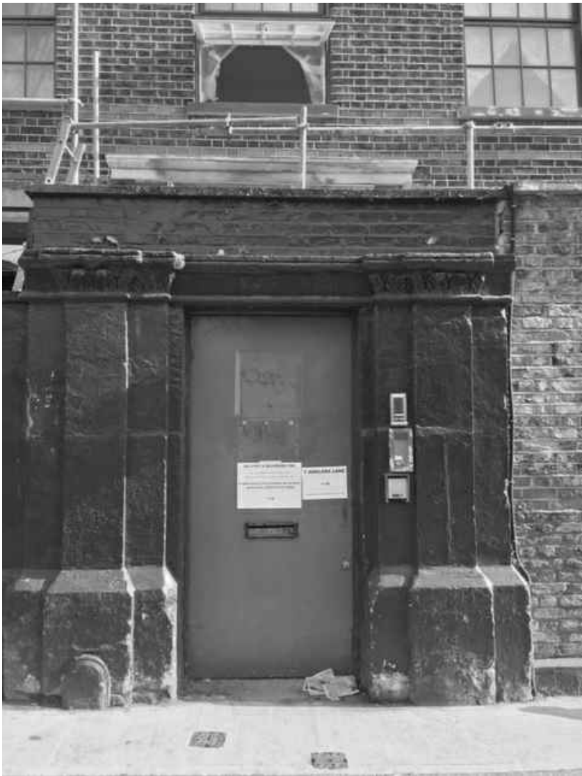
Existing Temporary Door

NOTES -Do not scale from this drawing, except for planning purposes. -Check all dimensions on site. -Subject to survey. -Subject to site inspection. -Site boundary lines are indicative only.