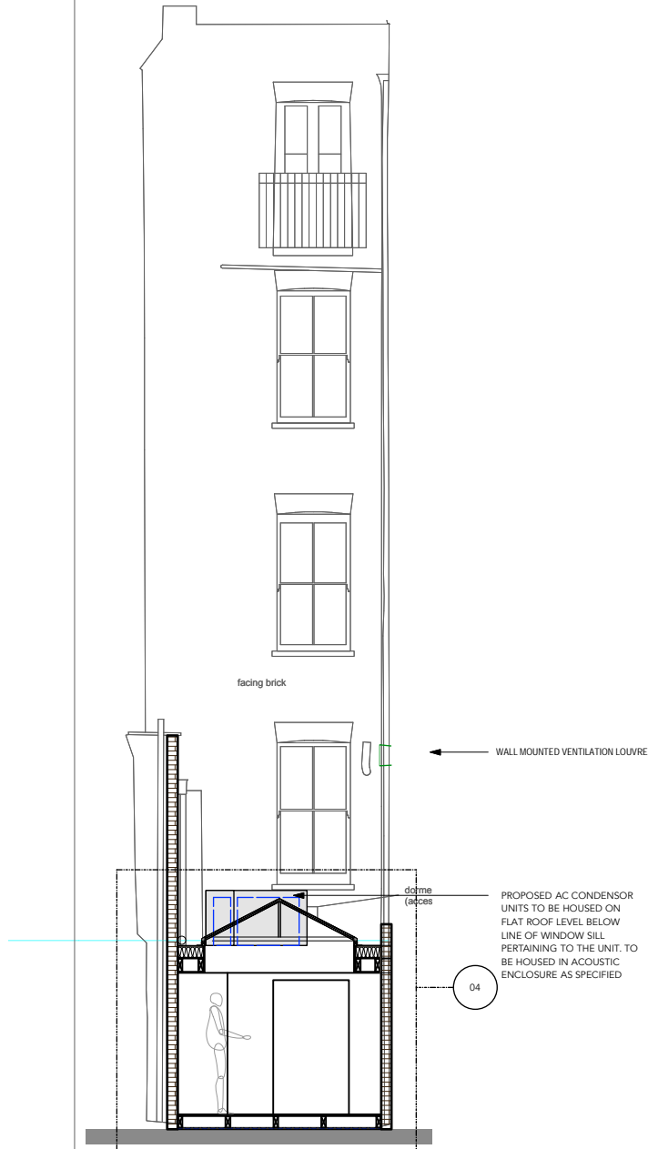
3 SECTION BB Scale: 1:50