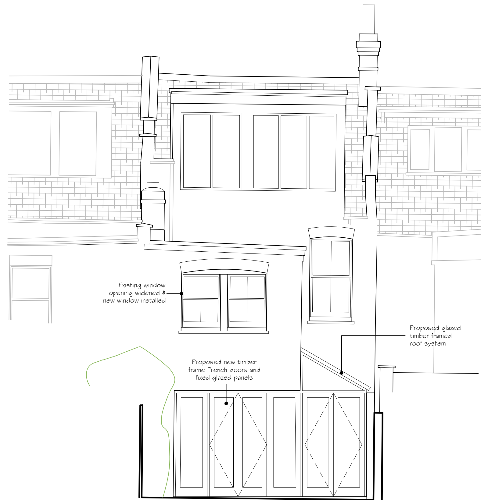
Proposed Rear Elevation - Alternative B. Scale 1:50