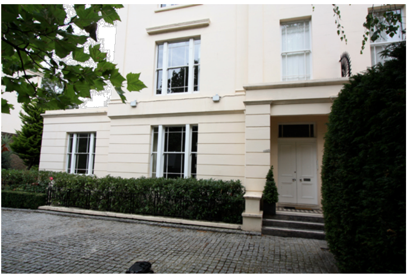
Front Elevation - Entrance