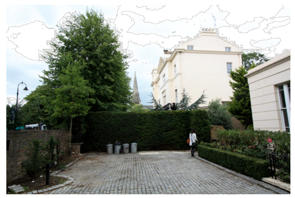
Front Drive Way - Looking West