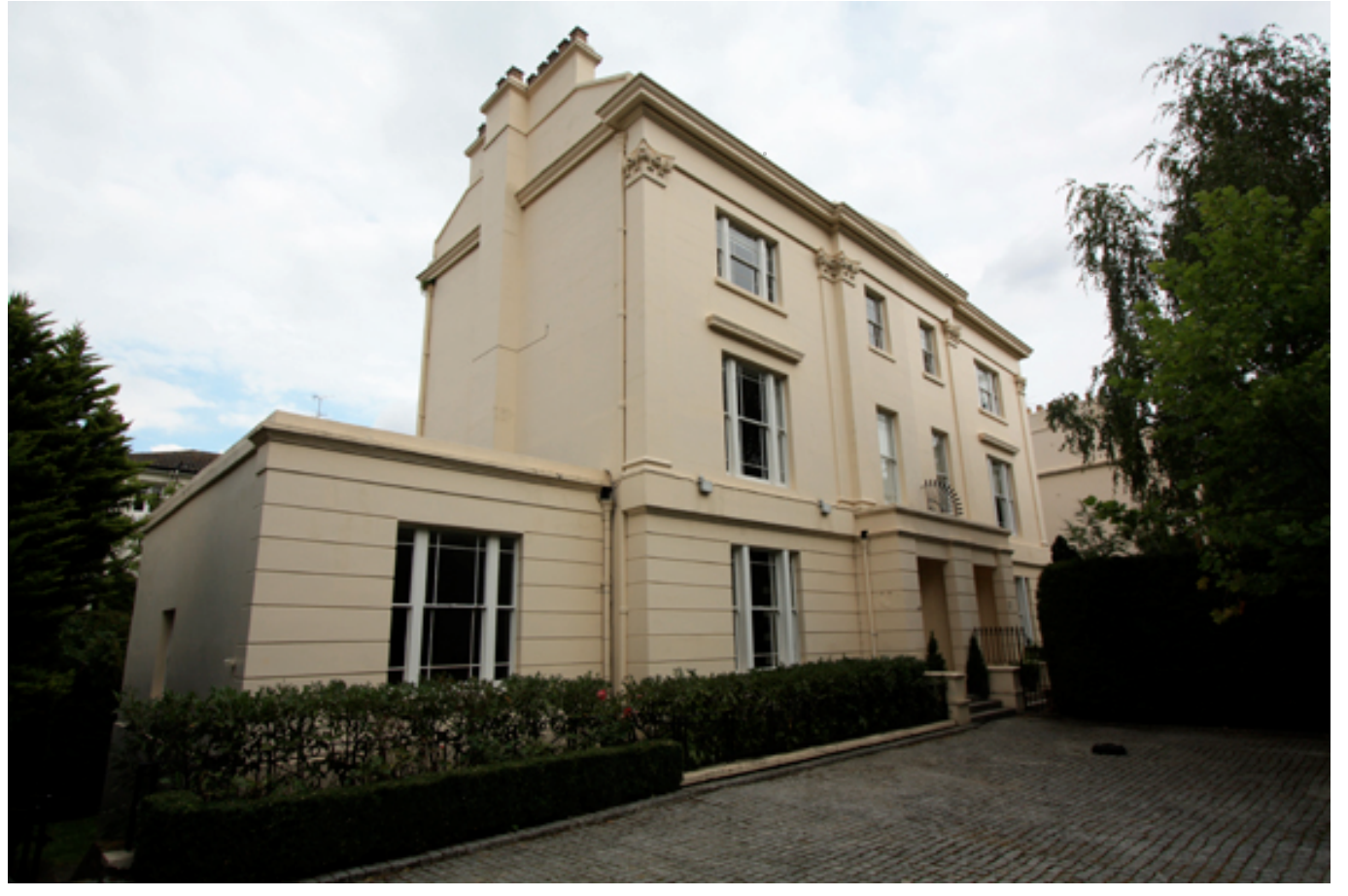
13 Prince Albert Road - Front elevation