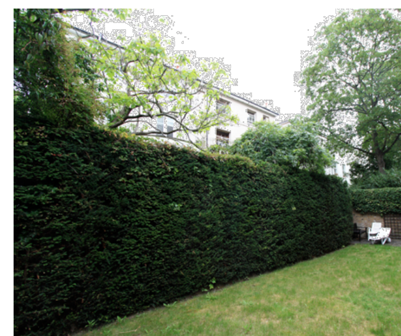
Rear Garden - Looking East