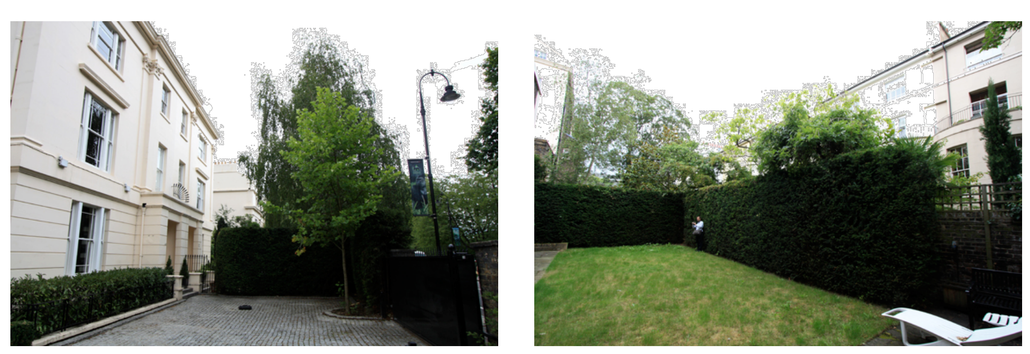
Front Drive Way - Looking East