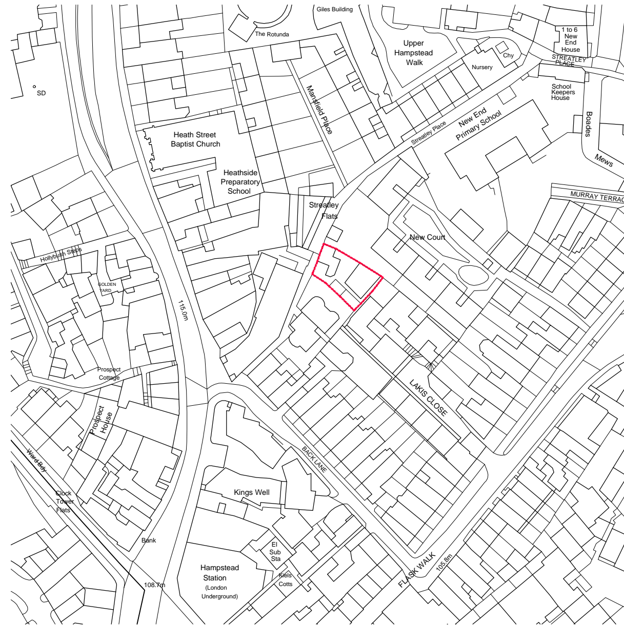
Existing Location Plan 1:1250 @ A3