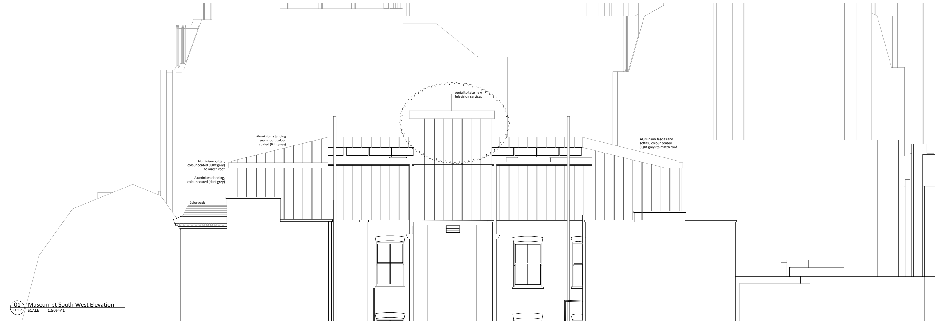
01 Museum st South West Elevation SCALE 1:50@A1

NOTES CONSULTANTS - Refer to highways consultant's drawings for details - Refer to landscape consultant's drawings for details - Landscaping layout is indicative only AREAS - Refer to area schedule PLANNING © Copyright Reserved. ColladoCollins Partners LLP