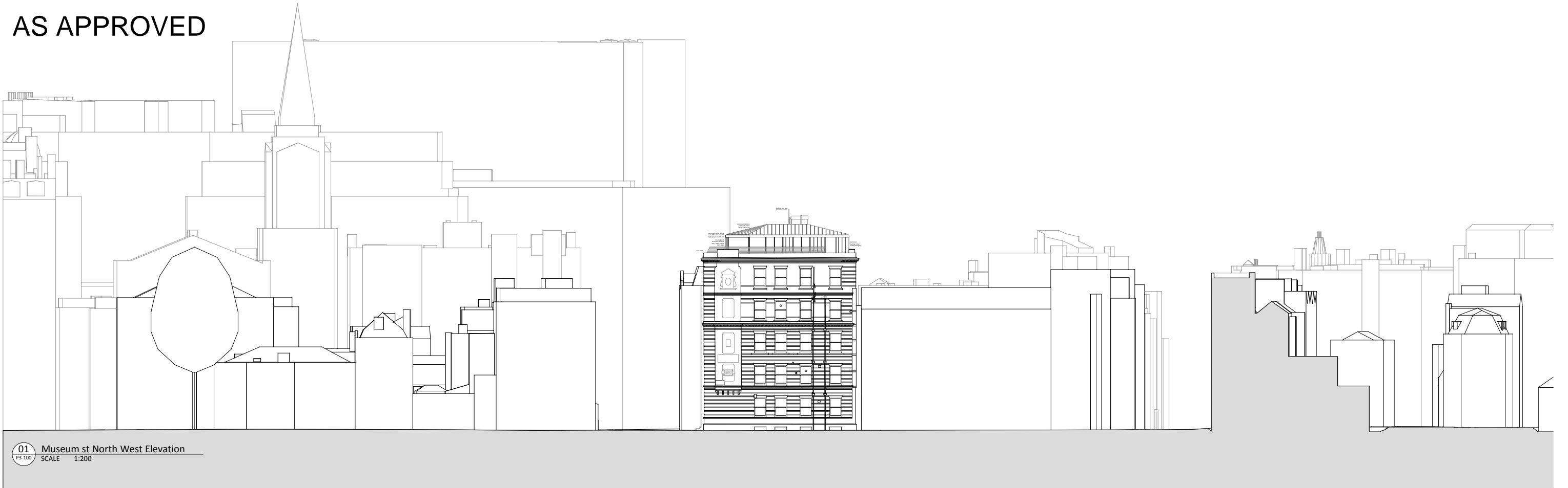
01 Museum st North West Elevation SCALE 1:200