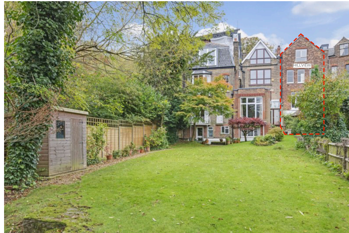
Image from property website that shows the rear elevation of the terrace properties. Note this is on adjoining property that stretches further than that of Hillview towards the pond.

NOTE Visibility from the rear elevation is screened by the reinstated gable end to the property and the existing party wall between Hillview and Lakeview. Side dormers kept deliberately low