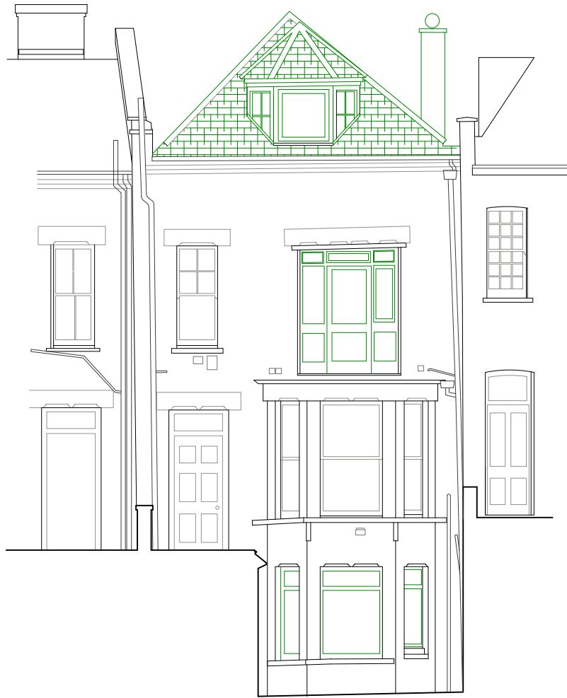
1 Existing Front Elevation 005