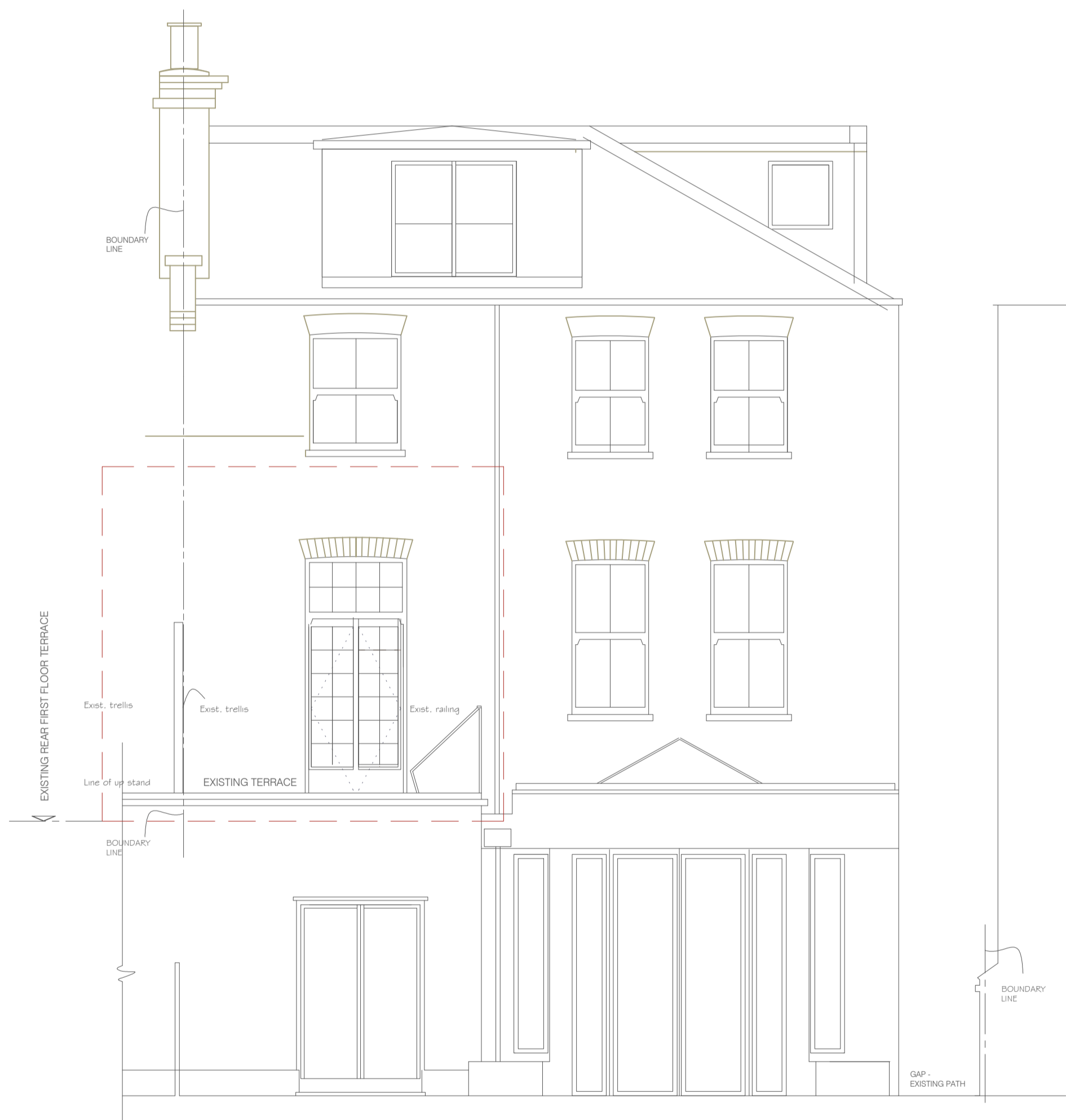
PRE BUILT REAR TERRACE PRE BUILT REAR 1ST FLOOR TERRACE

This drawing is to be read in conjunction with the structural engineers' drawings, all other layout and detail drawings together with the Schedule of Works and Specification.