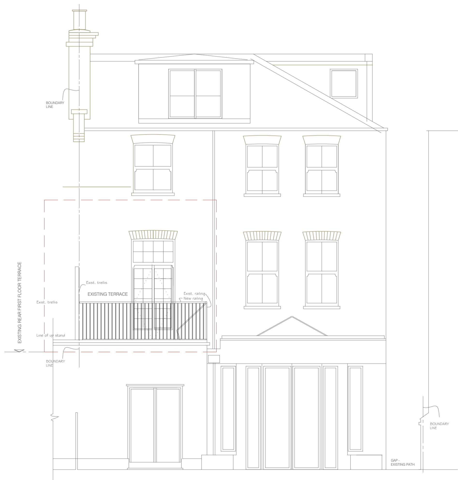
AS BUILT FIRST FLOOR RAILING AS BUILT FIRST FLOOR REAR TERRACE