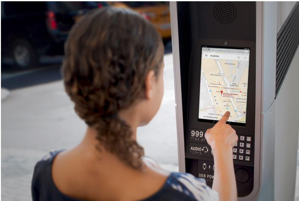
Figure 5: Link user interface

3.5 The unit has been designed with accessibility at the forefront for users of various abilities and physical capabilities. The user interface is simple and intuitive, creating an uncluttered appearance; see Figure 5.