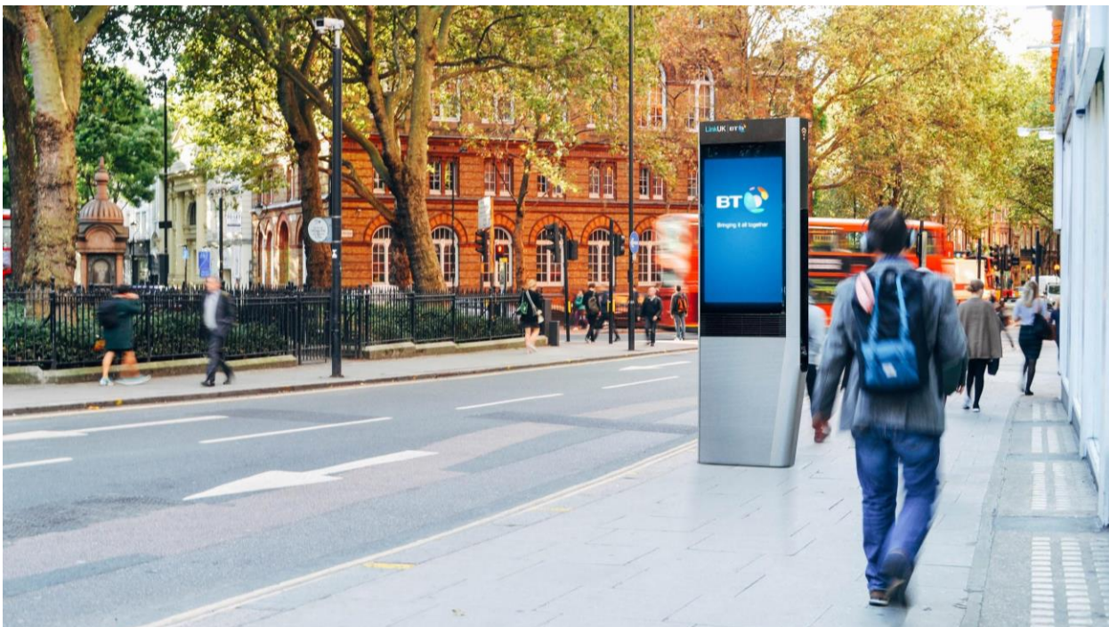
Figure 1: Link unit in Camden

1.4 The Link unit was developed and piloted in New York City and has already begun to be rolled out across New York with transformative results. BT, along with its partners at LinkUK, is seeking to bring the same benefits to the UK, beginning with London.