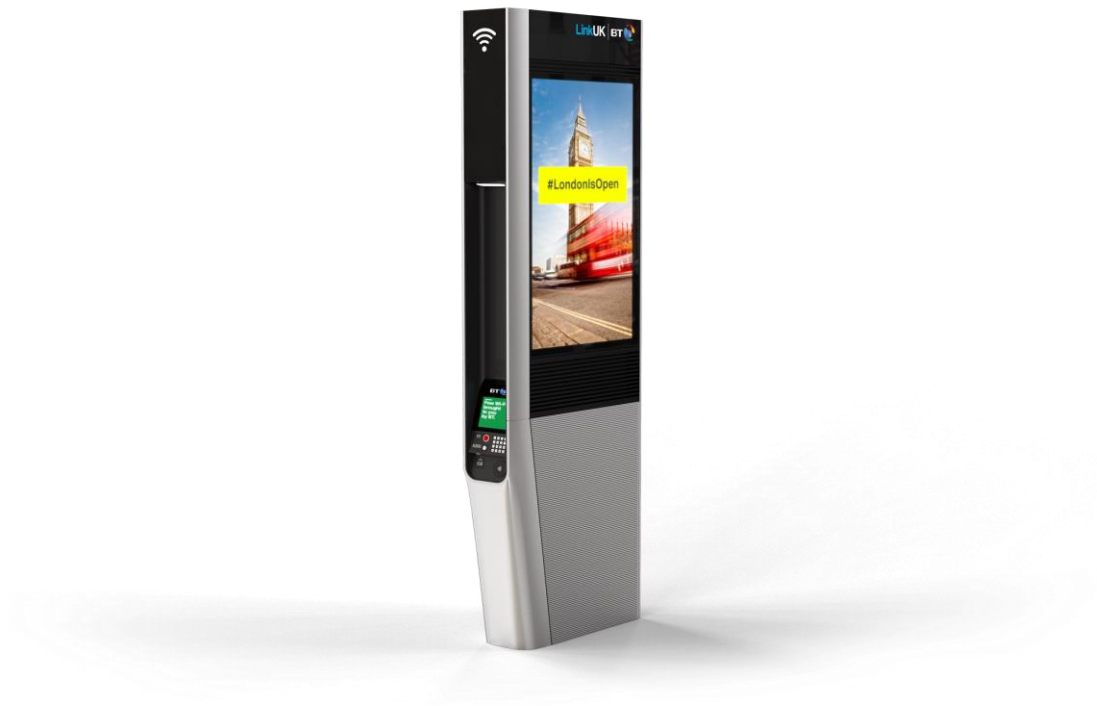
Figure 2: Link unit

3.1 The structural design and appearance of the Link unit is centred on a desire for integration with the urban environment and ease of use for users.