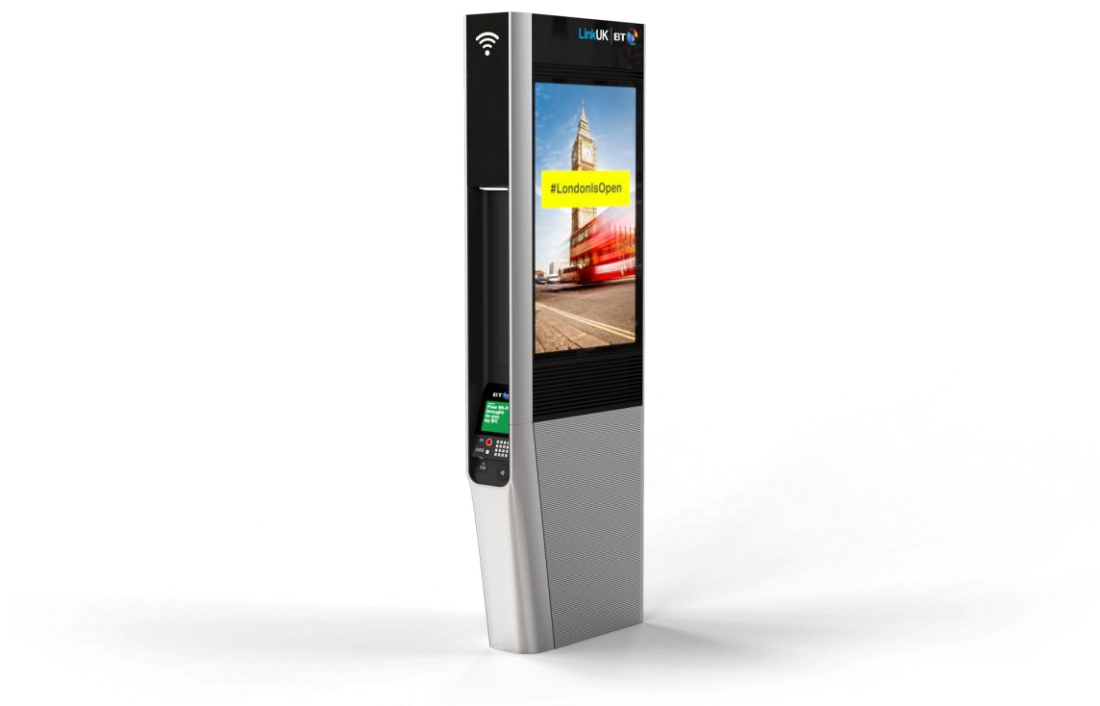
Figure 2: Link unit

3.1 The structural design and appearance of the Link unit is centred on a desire for integration with the urban environment and ease of use for users.