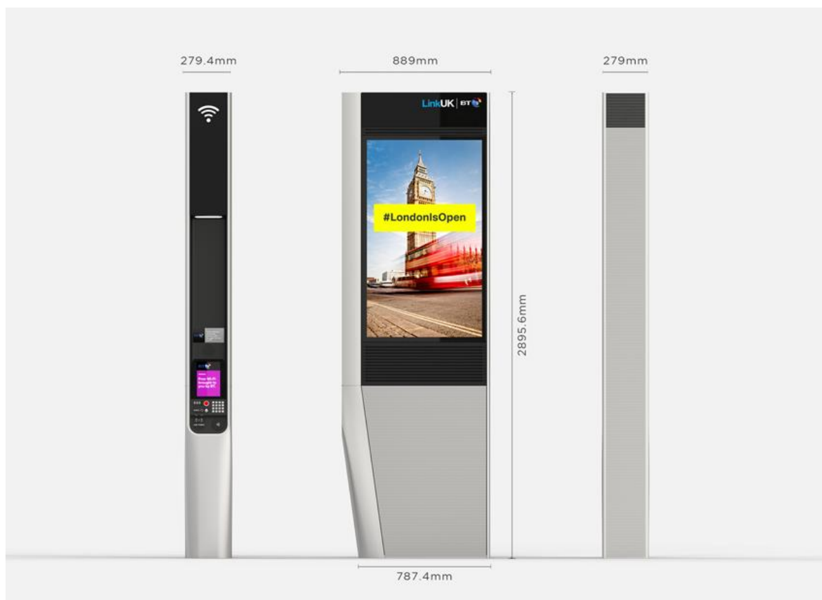
Figure 3: Link unit overall dimensions

3.3 The overall dimensions are 787mm wide by 280mm deep at ground level, and 889mm wide by 280mm at the top of the unit. The narrower base reduces the street footprint further and gives a slender, elegant appearance. The total height of the unit is 2895.6mm.