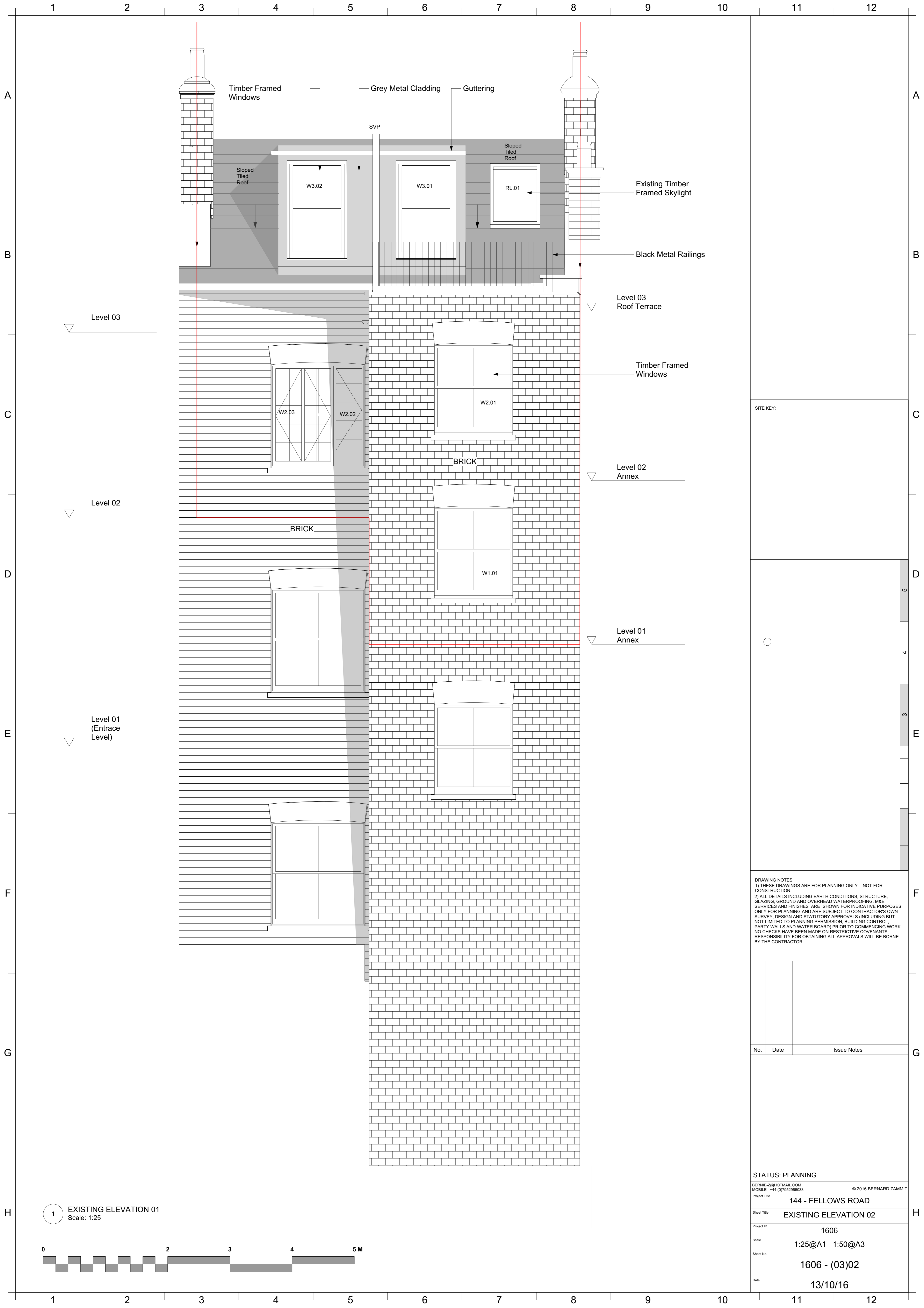
1 EXISTING ELEVATION 01 Scale: 1:25