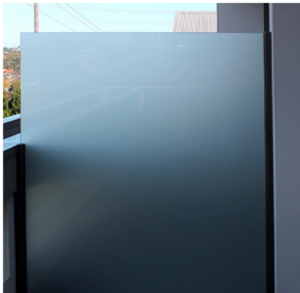
OBSCURED GLASS PRIVACY SCREEN EXAMPLE

EXISTING INFORMATION PROVIDED BY CLIENT ALL WORKS TO BE IN ACCORDANCE WITH CURRENT BUILDING REGULATIONS AND TO BE READ AND CONSTRUCTED IN CONJUNCTION WITH A SCHEDULE OF WORKS DOCUMENT AND STRUCTURAL ENGINEER'S INFORMATION ALL DEMOLITION TO BE APPROVED BY STRUCTURAL ENGINEER PRIOR TO COMMENCEMENT ALL DIMENSIONS, EXISTING LEVELS, DRAIN RUNS AND SITE CONDITIONS TO BE VERIFIED ON SITE BY CONTRACTOR PRIOR TO CONSTRUCTION, AND ANY DISCREPANCIES MADE KNOWN RE-ROUTING OF EXISTING AND RUNNING OF NEW DRAINAGE TO BE TO CONTRACTOR'S DESIGN DRAWINGS ARE FOR PLANNING PURPOSES ONLY AND ARE NOT ISSUED FOR CONSTRUCTION COPYRIGHT FLOWER MICHELIN ARCHITECTS LLP 2016