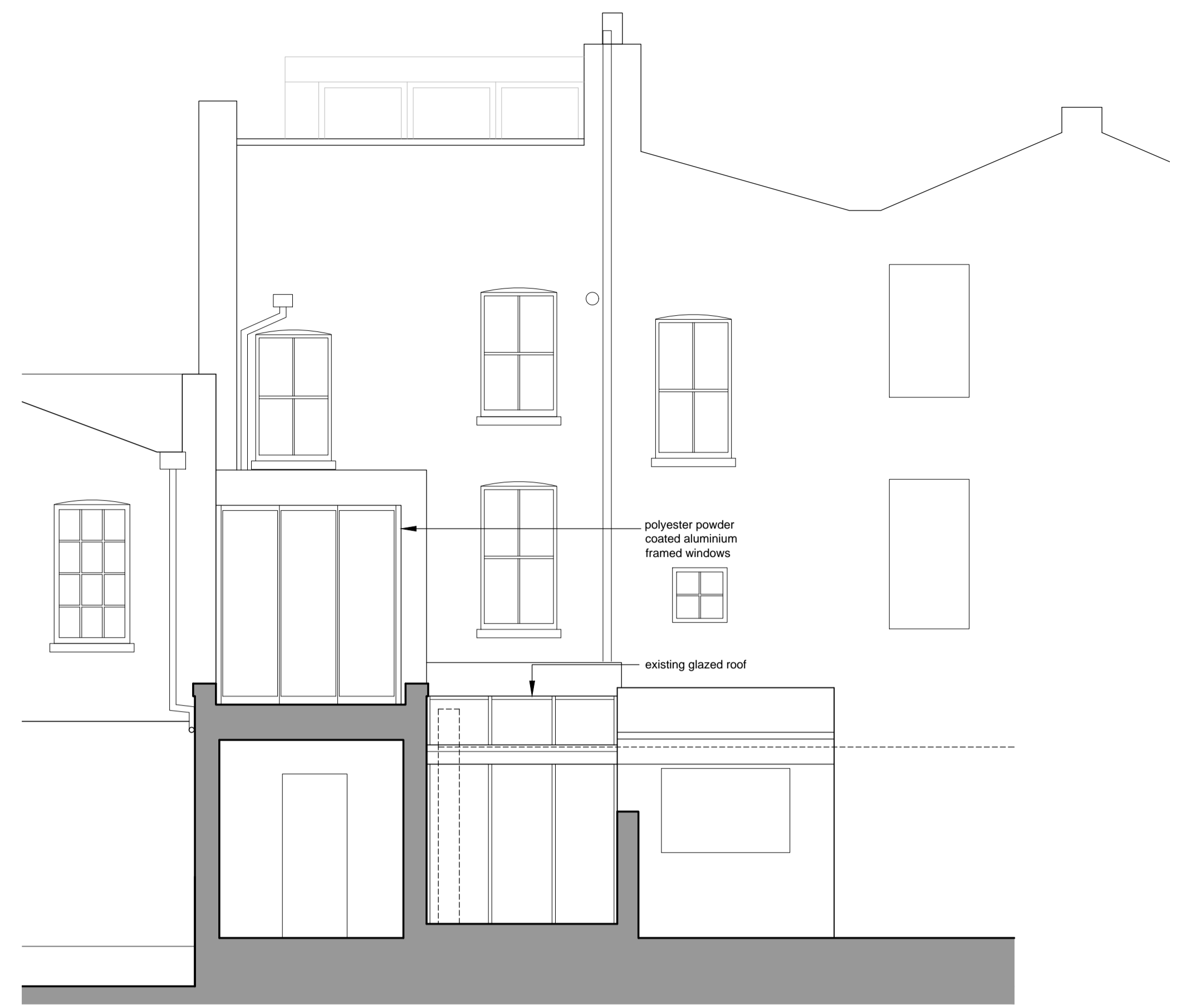
PROPOSED SECTION EE