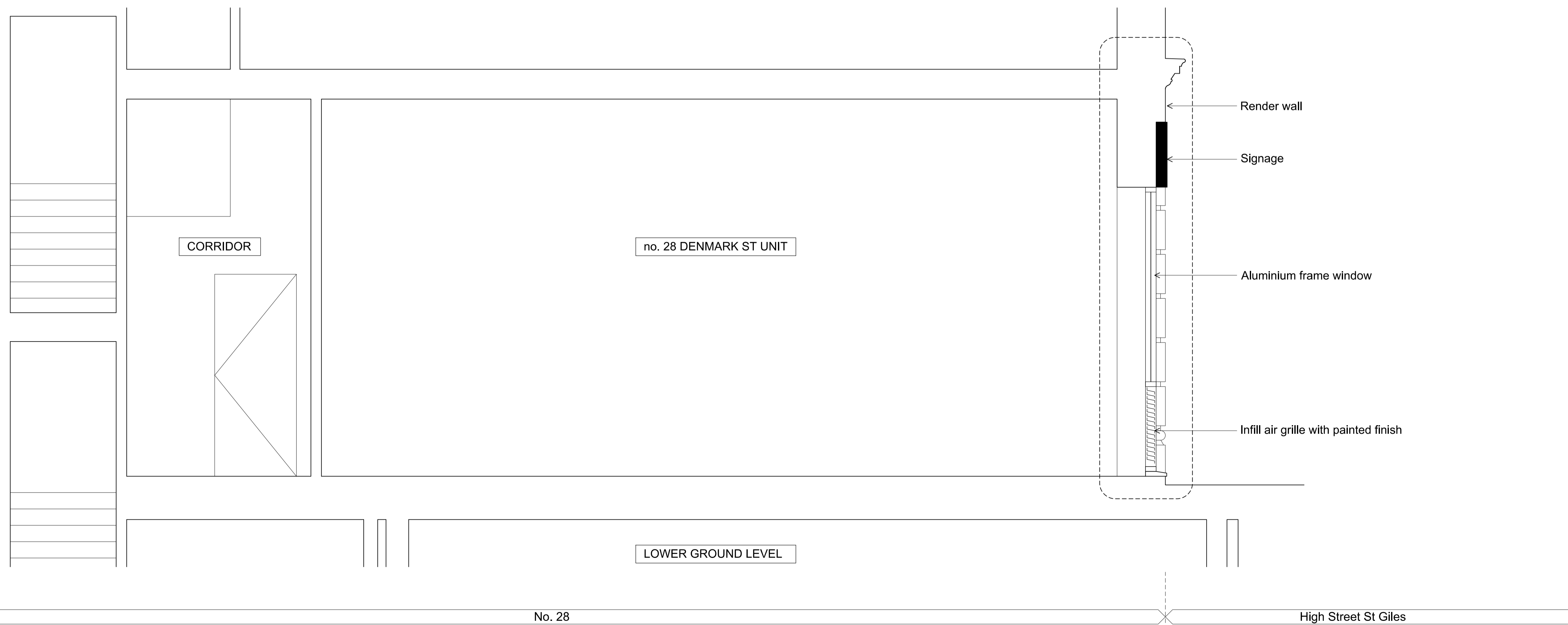
02 28 Denmark Street - Existing Ground Level Section 1:25