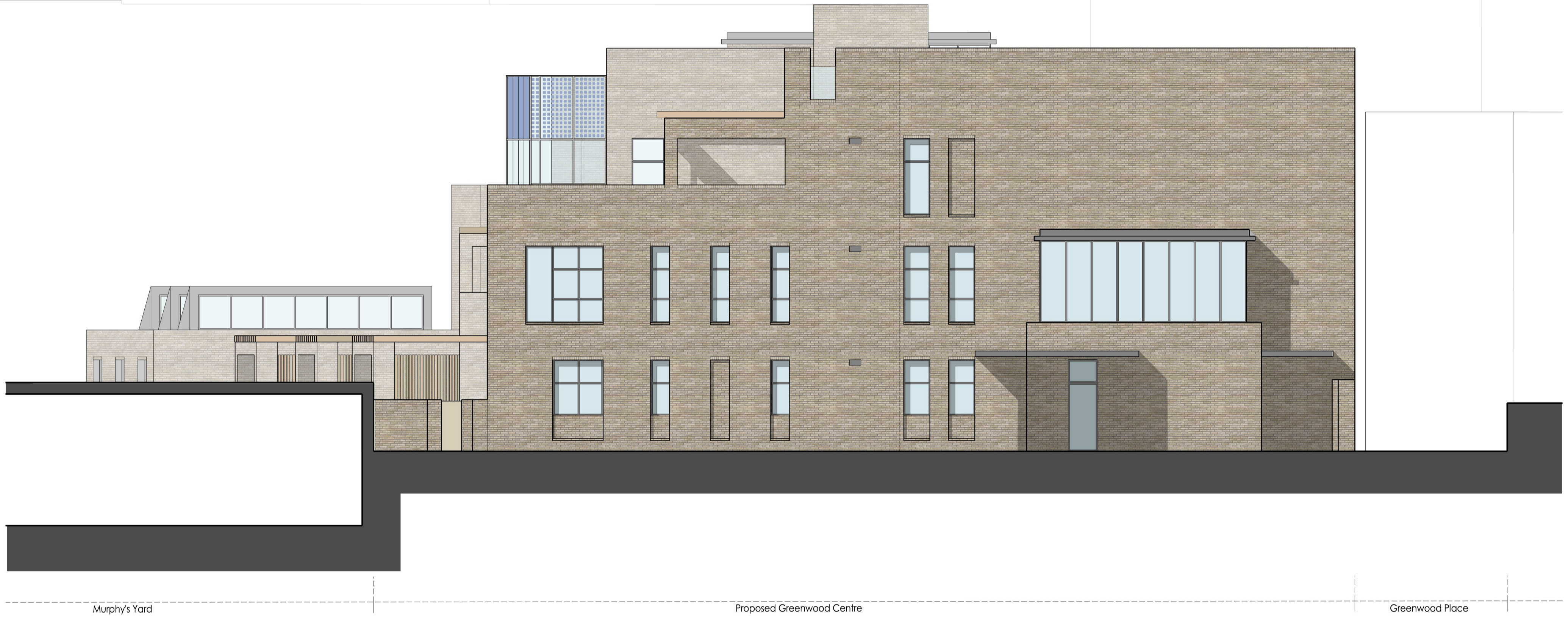
EAST ELEVATION 3-3

FIGURED DIMENSIONS ARE TAKEN TO STRUCTURE UNLESS INDICATED OTHERWISE. ALL DIMENSIONS TO BE CHECKED ON SITE PRIOR TO COMMENCEMENT OF WORK. DRAWINGS TO BE USED IN CONSTRUCTION WITH ALL OVERSIGHT DRAWINGS, CONSULTANTS AND SPECIFICALLY DRAWING CONSTRUCTION RULES, SPECIFICATIONS AND APPROVED REQUIREMENTS WHERE APPLICABLE. ANY DEVIATION MUST BE BRIDGED TO THE ATTENTION OF PH & PH. ALTHOUGH ALL ANY MODIFICATION TO THE DRAWING MUST BE CARRIED OUT BY PH & PH. THE DRAWING REMAINS UNDER THE COPYRIGHT OF PCKO ARCHITECTS LIMITED. PLEASE OBTAIN PERMISSION BEFORE COPYING. WHERE METHOD OF CONSTRUCTION INCORPORATES TIMBER JOIST GAUGE STEEL, PLEASE ALL ELEMENTS OF FRAMING INCLUDING SPIND LOCATION, JOISTING, SHEATHING, LINERS, TRUSSES AND KING BRACING TO BE IN PLAIN MANUFACTURE METHOD, DETAIL AND SPECIFICATION. ALL STRUCTURAL ELEMENTS ARE SHOWN IN SECTION. ALL ELEMENTS OF STRUCTURE REFER TO STRUCTURAL ENGINEERS AND SPECIALIST SUB-CONTRACTOR/FABRICATOR'S DESIGN DETAIL AND SPECIFICATION. ALL MECHANICAL AND ELECTRICAL ELEMENTS ARE SHOWN IN SECTION. FOR ALL MECHANICAL REFER TO BUILDING SERVICES ENGINEERS AND SPECIALIST SUB-CONTRACTORS DESIGN, DETAIL AND SPECIFICATION.