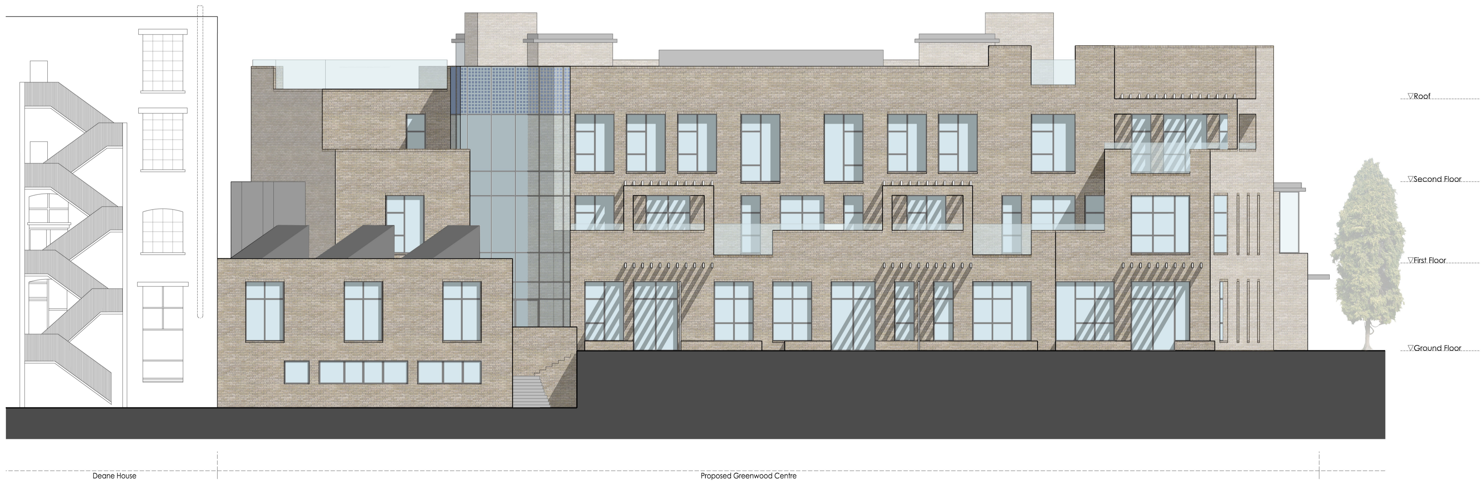
REAR ELEVATION 2-2