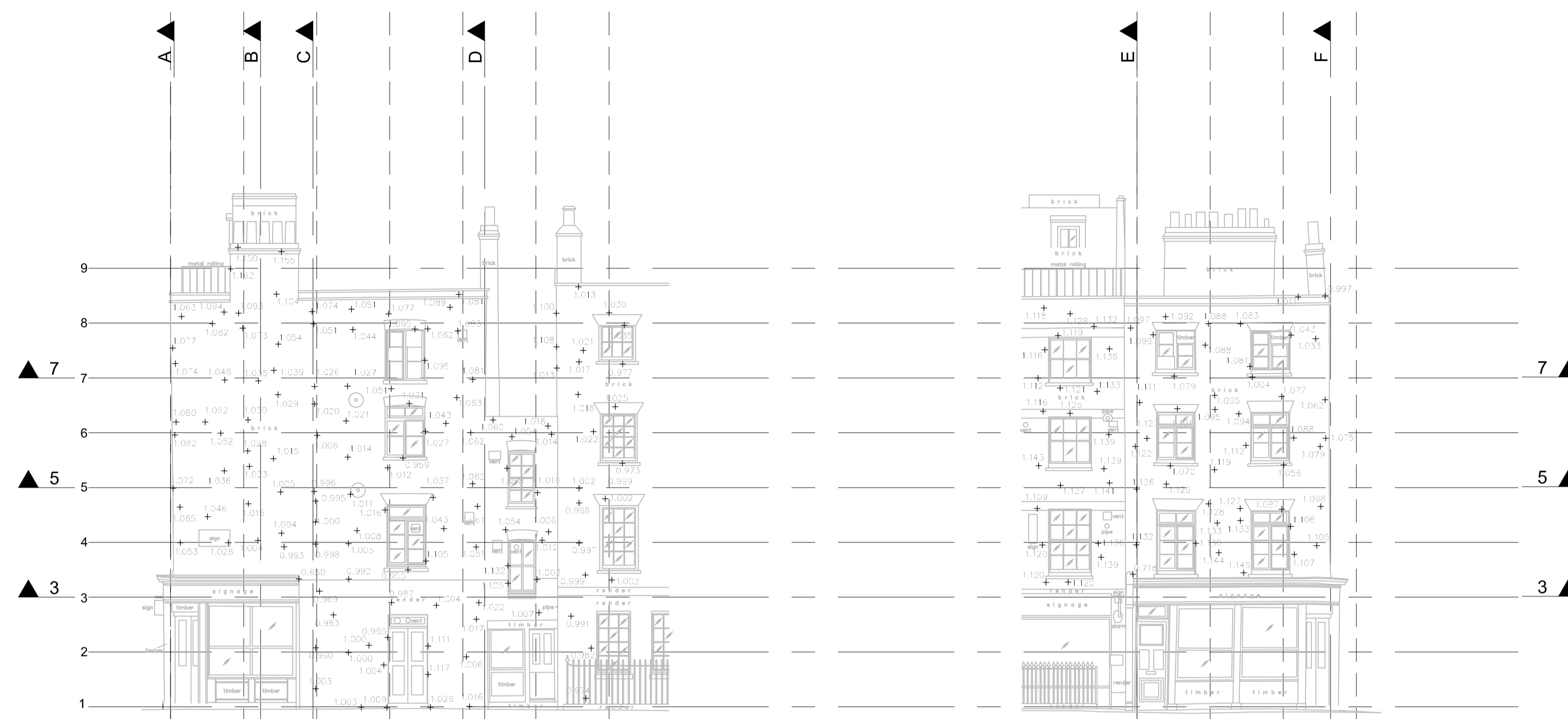
GOODGE PLACE ELEVATION A