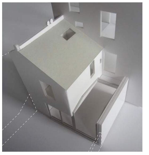
Aerial view of side extension and new roof light in sloping roof