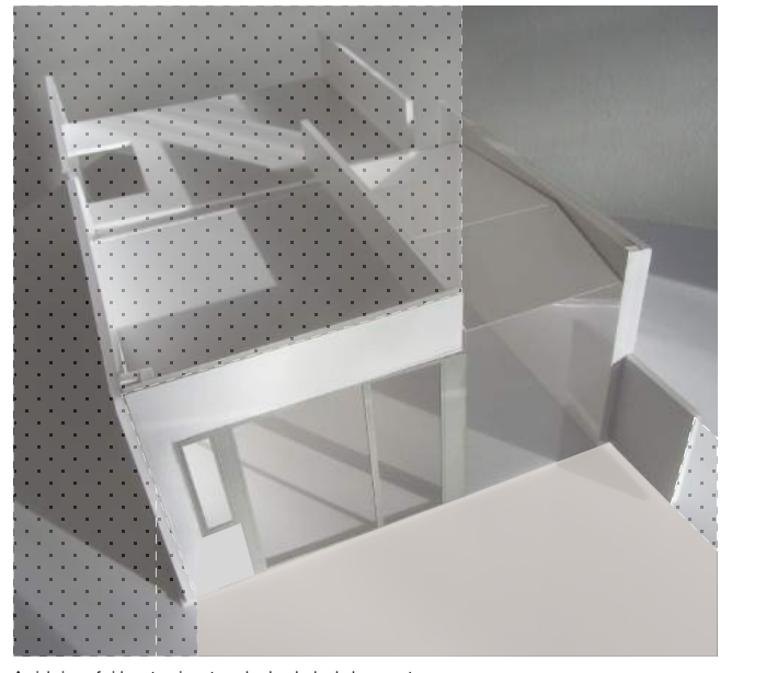
Aerial view of side extension at garden level: shaded area not modeled

16 Raveley Street NW5 2HU Raveley Street: Proposed Side Extension Model Photographs 03_9000 NTS at A3 PLANNING ISSUE January, 2017