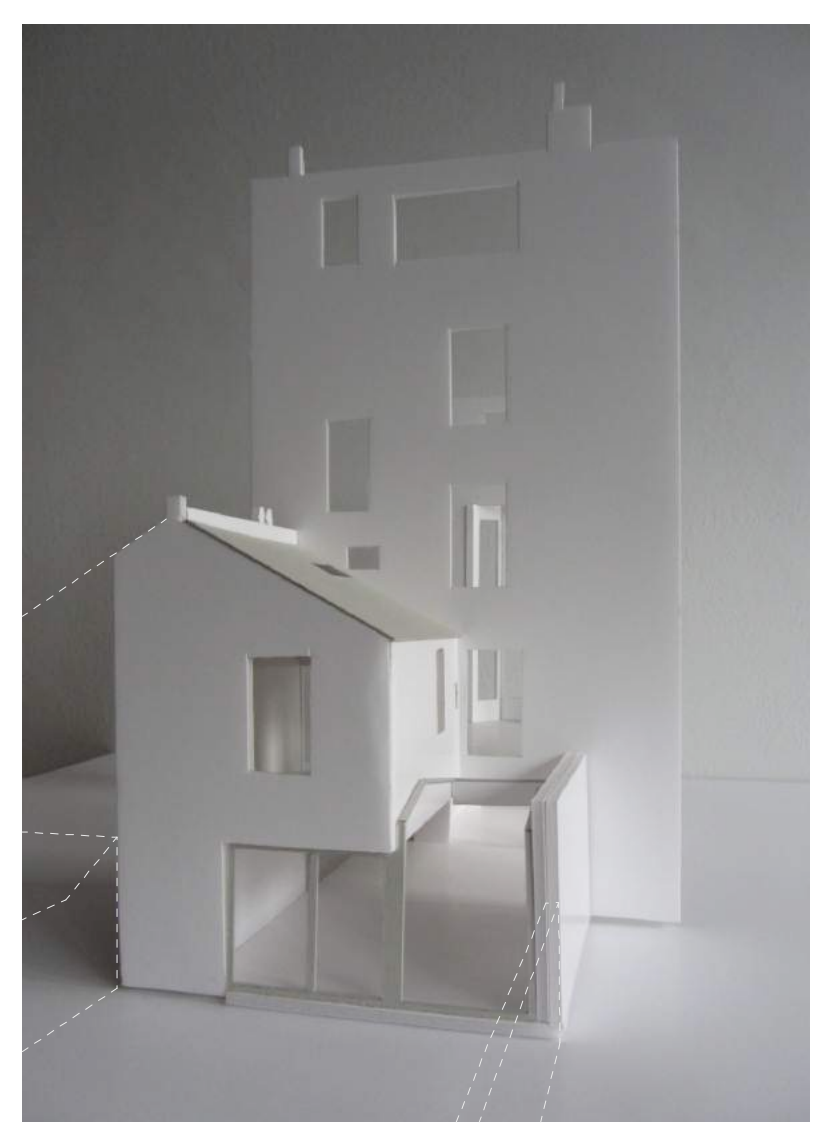
View of side extension from rear garden