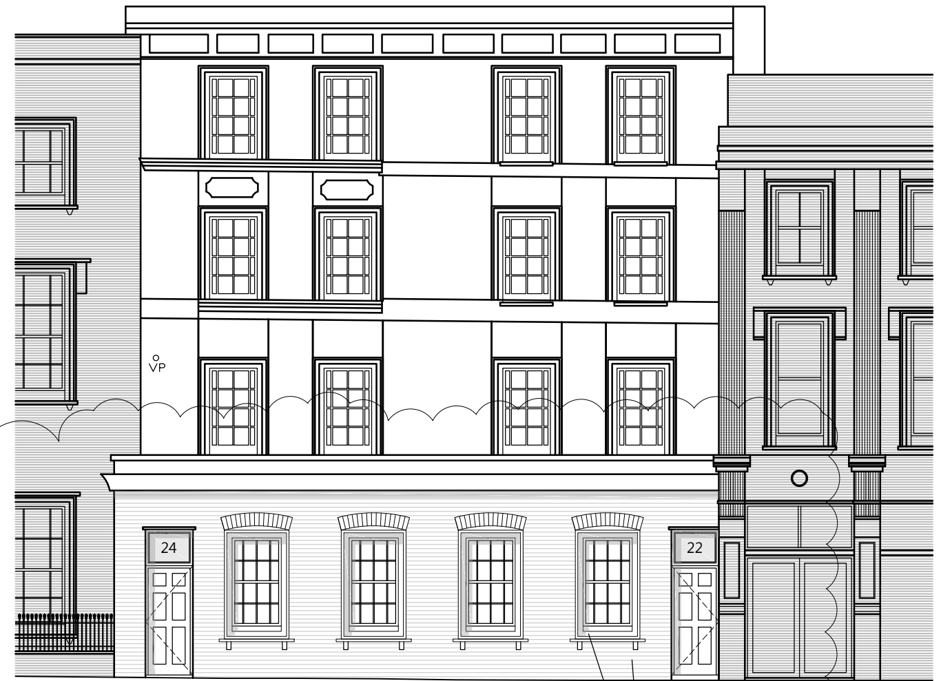
Proposed Front Elevation (View from Prince of Wales Road)

Brickwork to match existing Timber frame sash windows, painted white and with window bars to match style of existing windows above