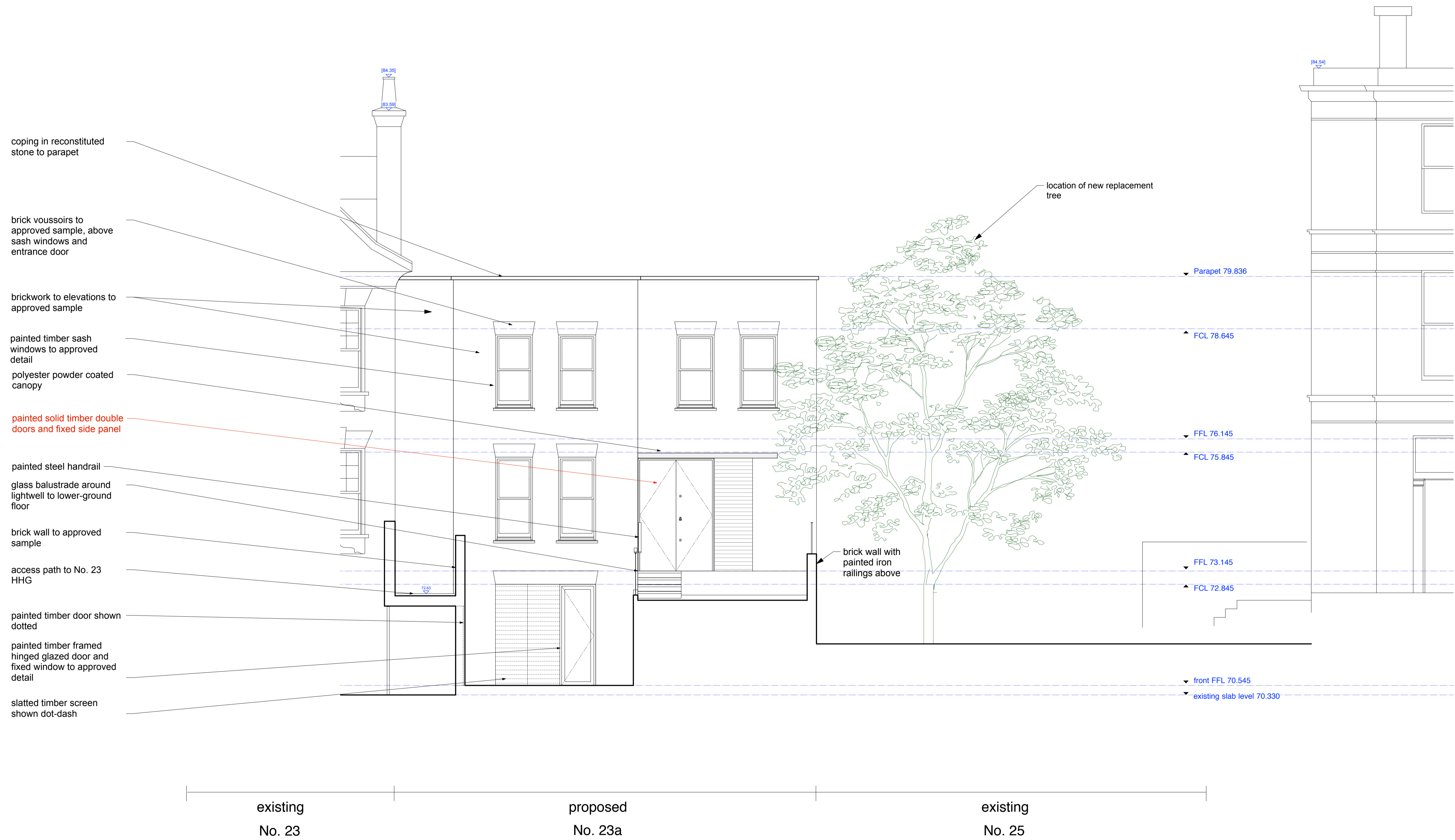
1 Proposed Front Elevation_Lightwell Elevation Scale: 1:50