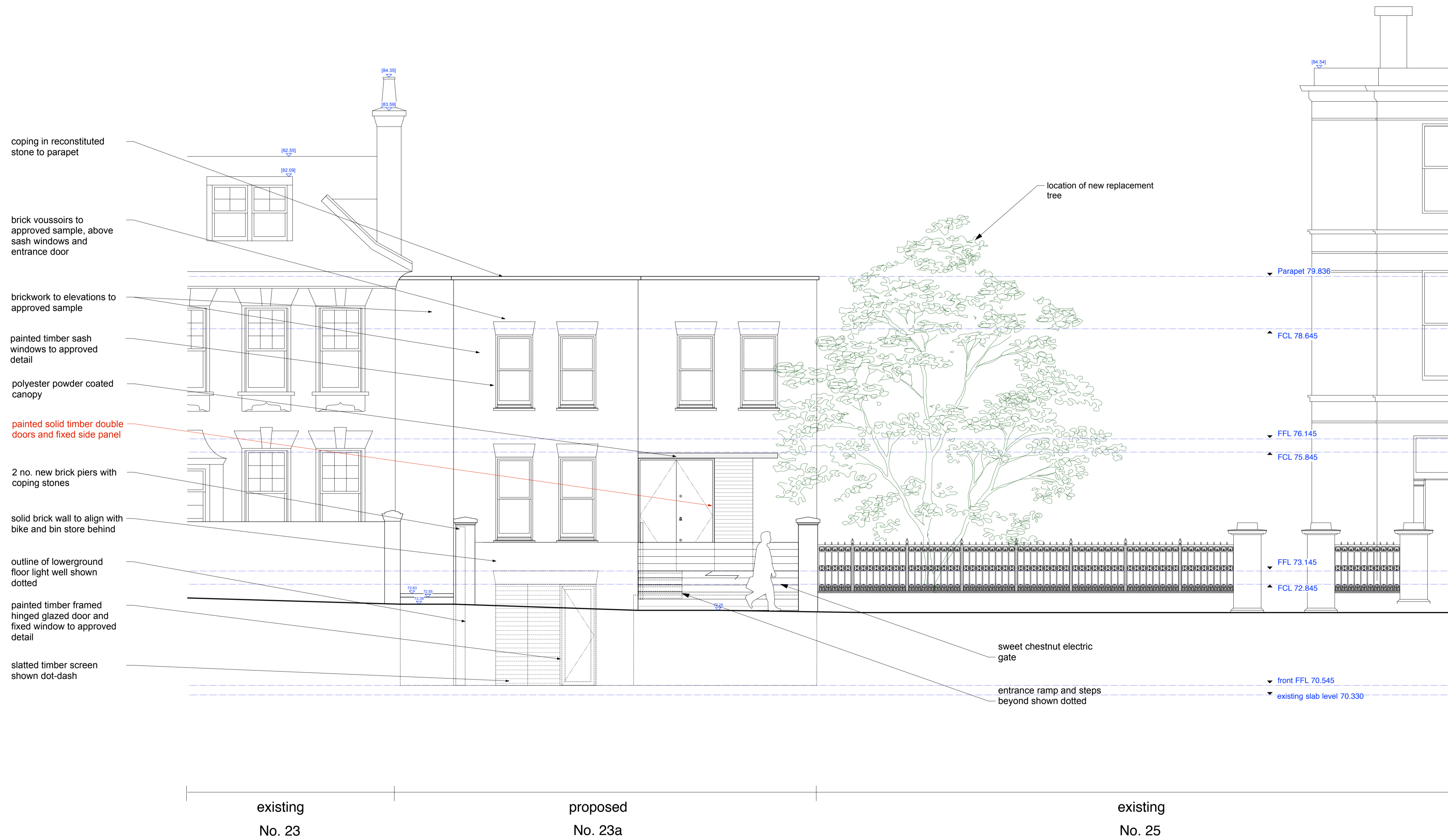
1 Proposed Front Elevation_Street Elevation Scale: 1:50