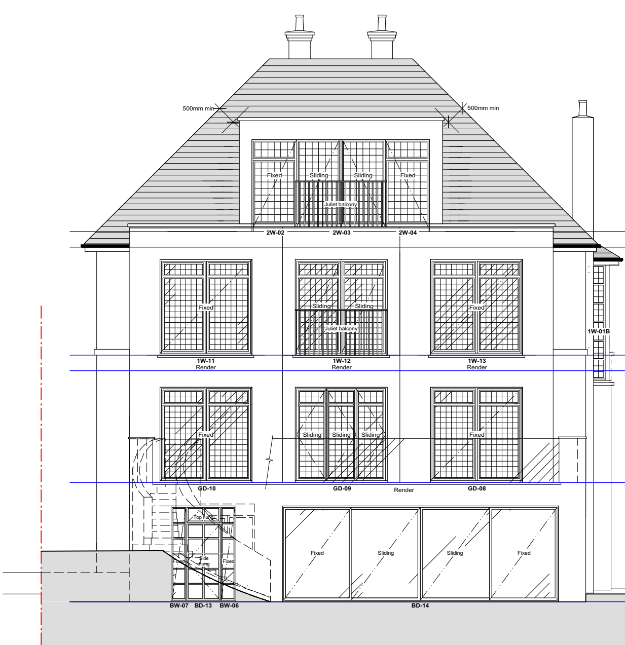
EXISTING SIDE (NORTH WEST) ELEVATION 1:100

EXISTING SIDE (SOUTH EAST) ELEVATION 1:100