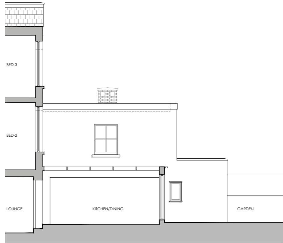
2 ELEVATION - SIDE EXISTING 1:100