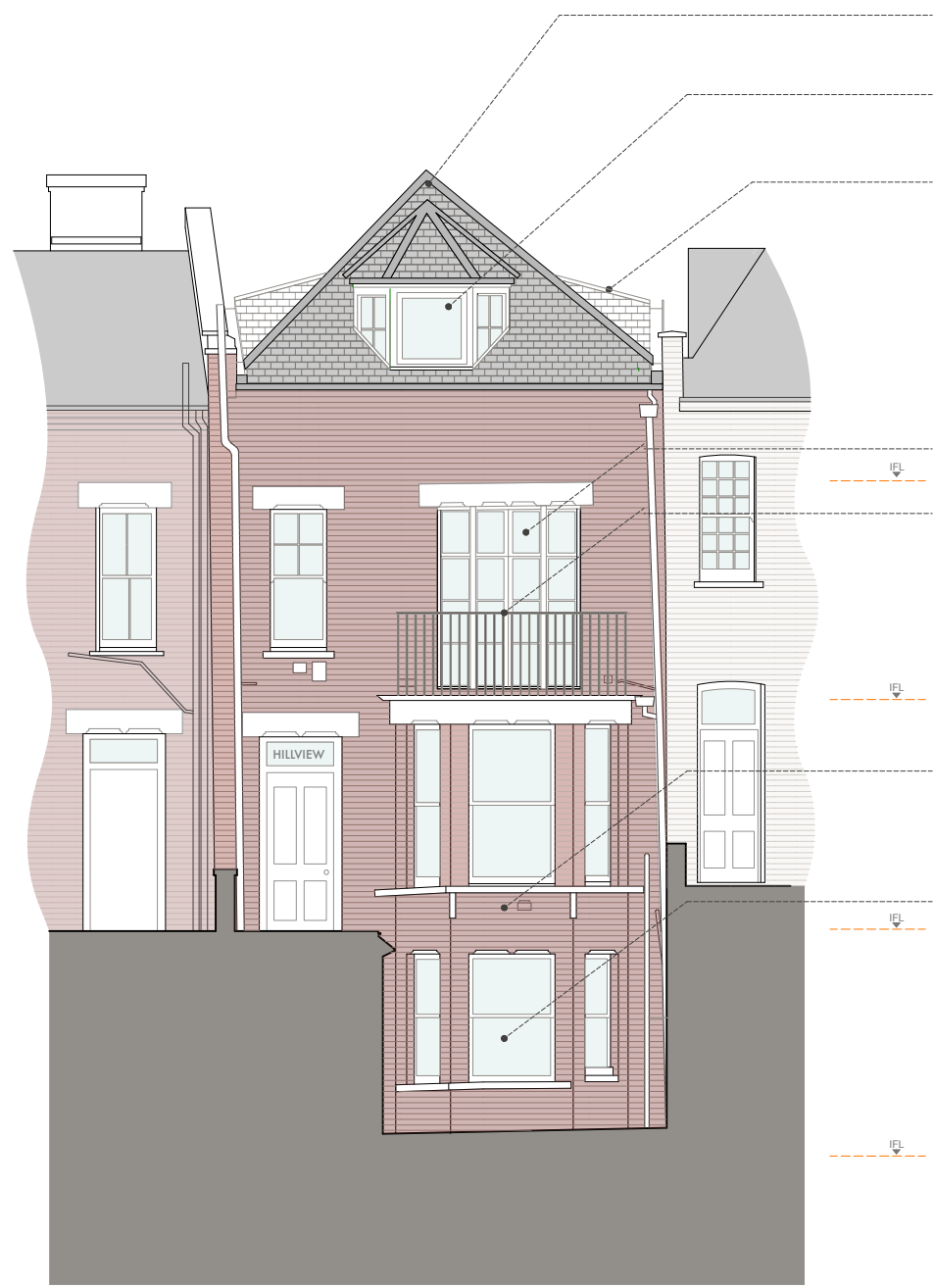
1 012 Proposed Front Elevation