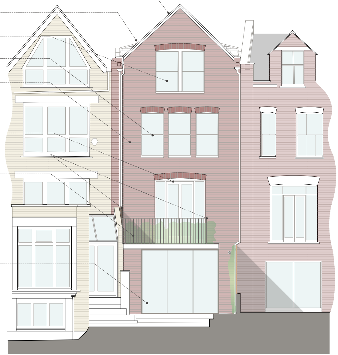
2 012 Proposed Rear Elevation