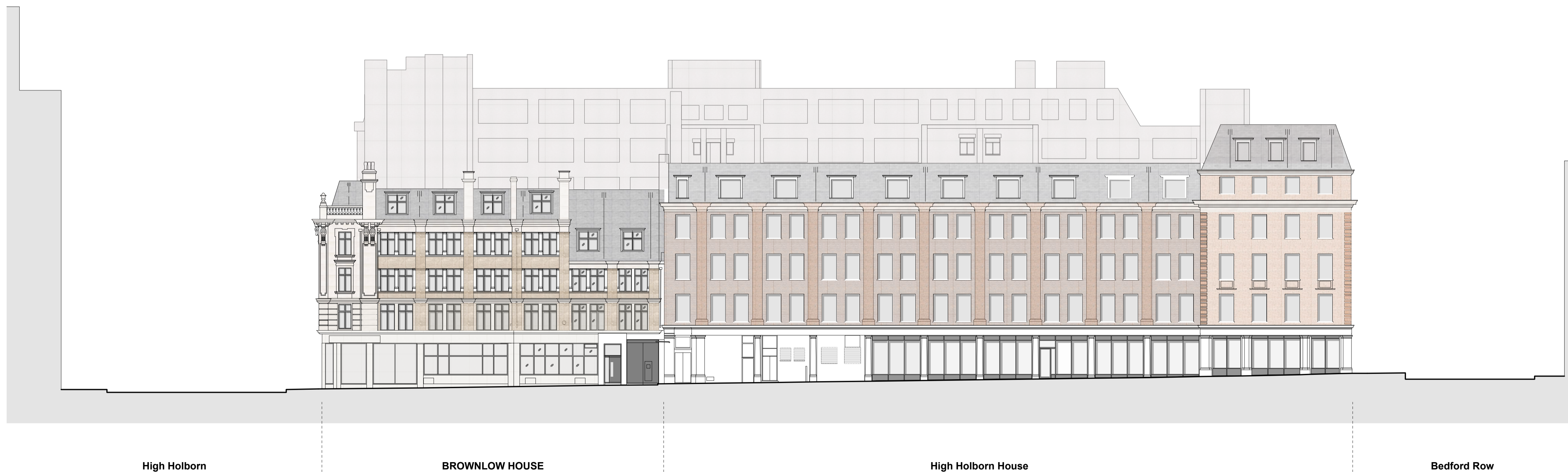
2 Existing Elevation B-B / Brownlow Street 1:200 at A1