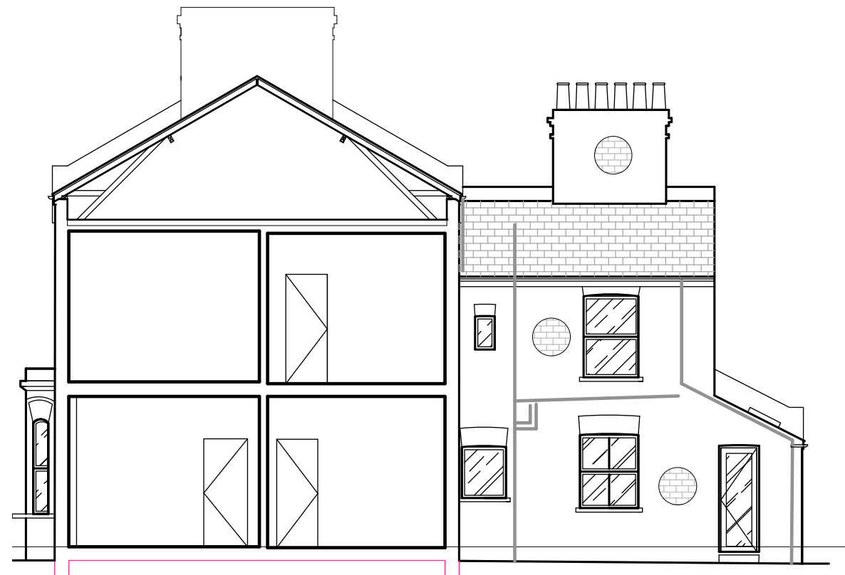
ELEVATION - EXISTING SECTION SCALE: 1:100 @ A3