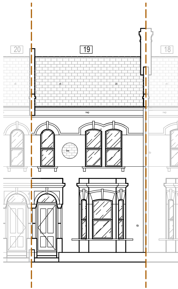
ELEVATION - EXISTING FRONT ELEVATION SCALE: 1:100 @ A3