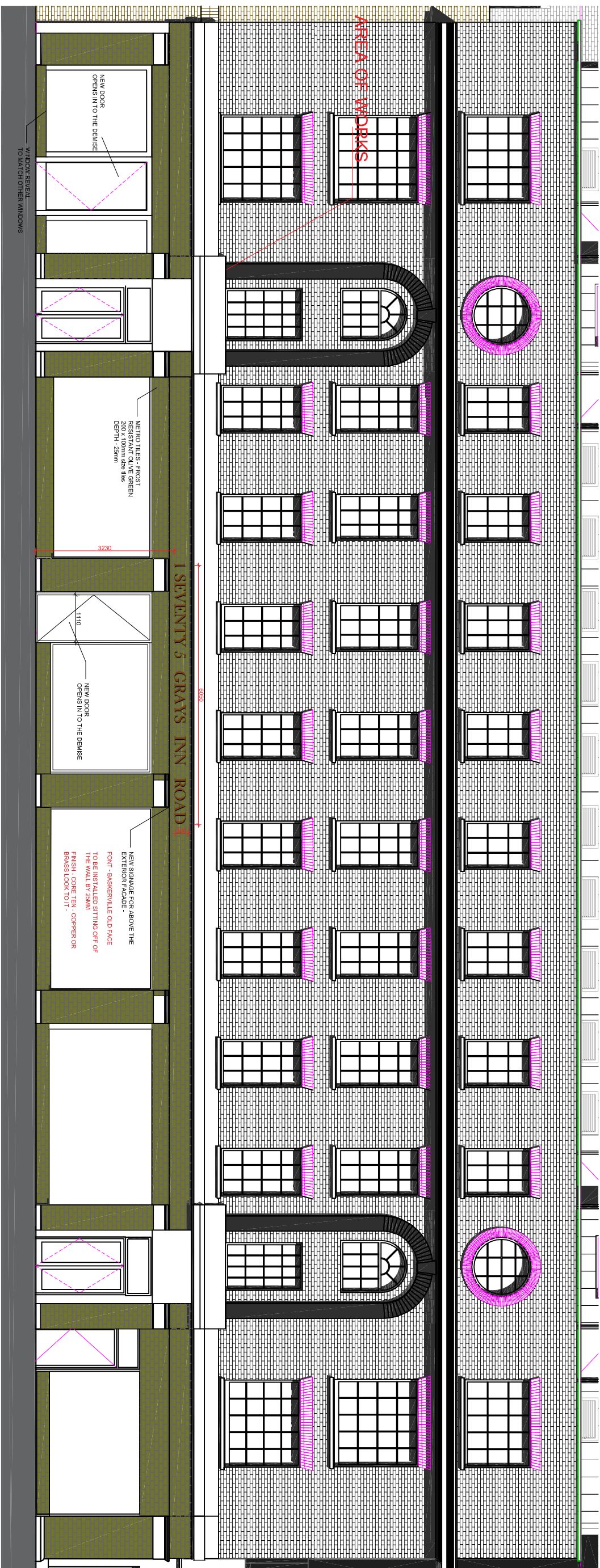
1.100 - ELEVATION AA

ThirdWay ThirdWay Interiors Ltd 2nd Floor, 3-5 Blandford Street Yard London EC2M 8BZ