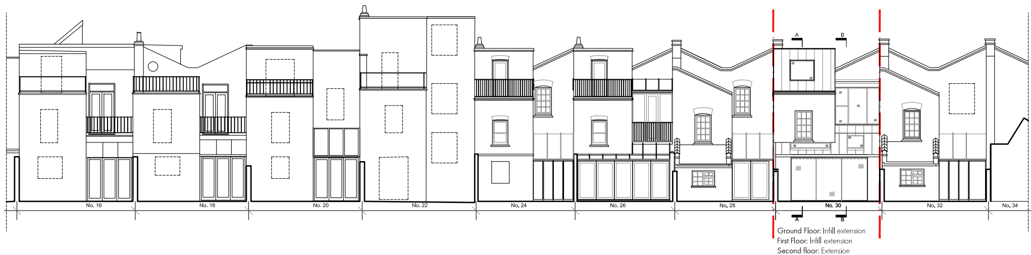
PROPOSED SITE ELEVATION 1:200 @ A3