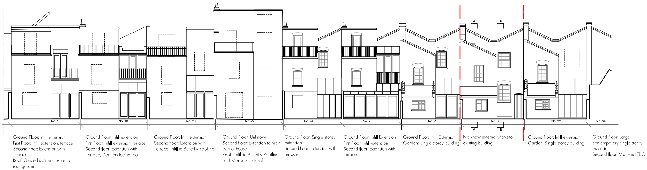
EXISTING SITE ELEVATION 1:200 @ A3

NOTES: Do not scale from this drawing. All dimensions to be checked on site prior to construction, and any discrepancies reported to the architect. Verify all dimensions and levels on site prior to construction. Neighbouring properties shown indicatively and based on information provided by others