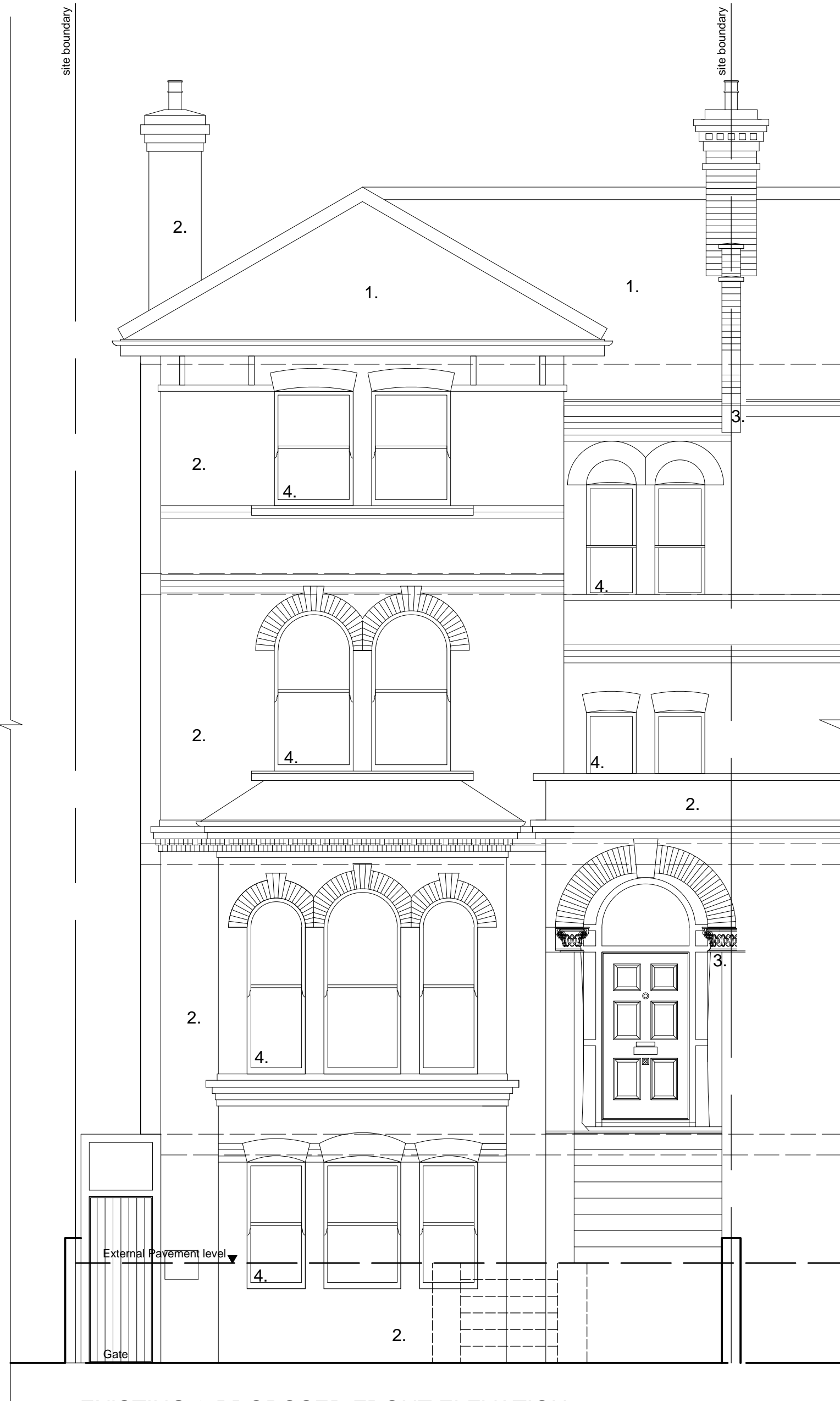
EXISTING & PROPOSED FRONT ELEVATION (NO CHANGE)