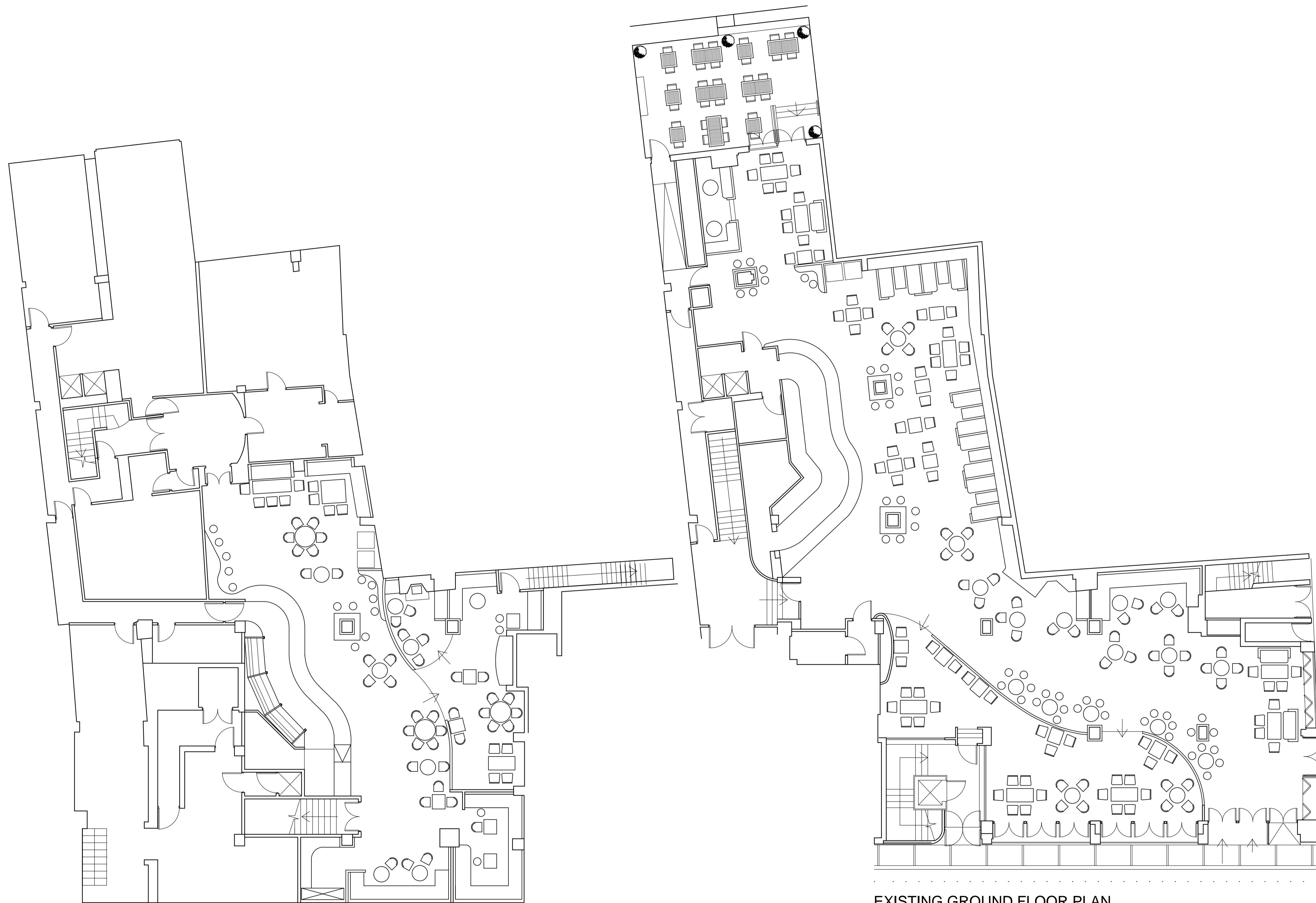
EXISTING BASEMENT PLAN

This drawing is the property of Design Venue Limited. Copyright and design rights are reserved by them and the drawing is issued on the condition that it is not copied either wholly or in part without the written consent of Design Venue Limited. Figured dimensions to take preference over those scaled. All dimensions to be checked on site before commencement of any work or shop drawings. This drawing is to be read with the specification when existing. Any discrepancies should be brought to the attention of the architect / designer.