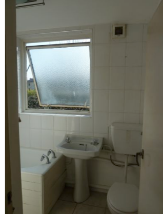
INTERIOR VIEW WINDOW B