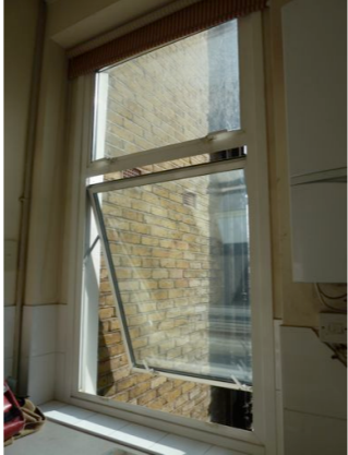
INTERIOR VIEW WINDOW A