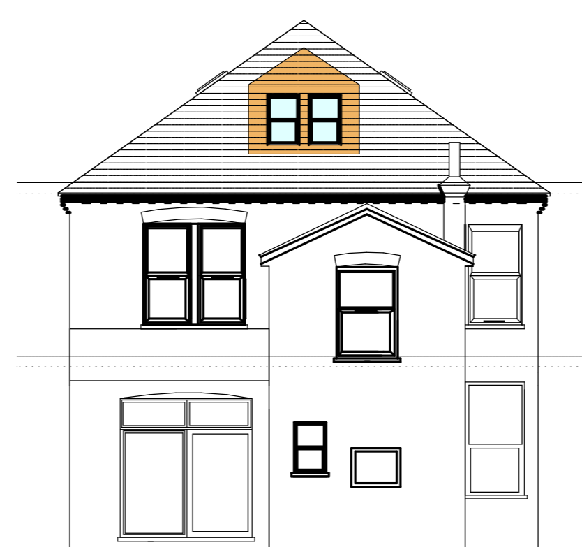
SIDE ELEVATION (LEFT)