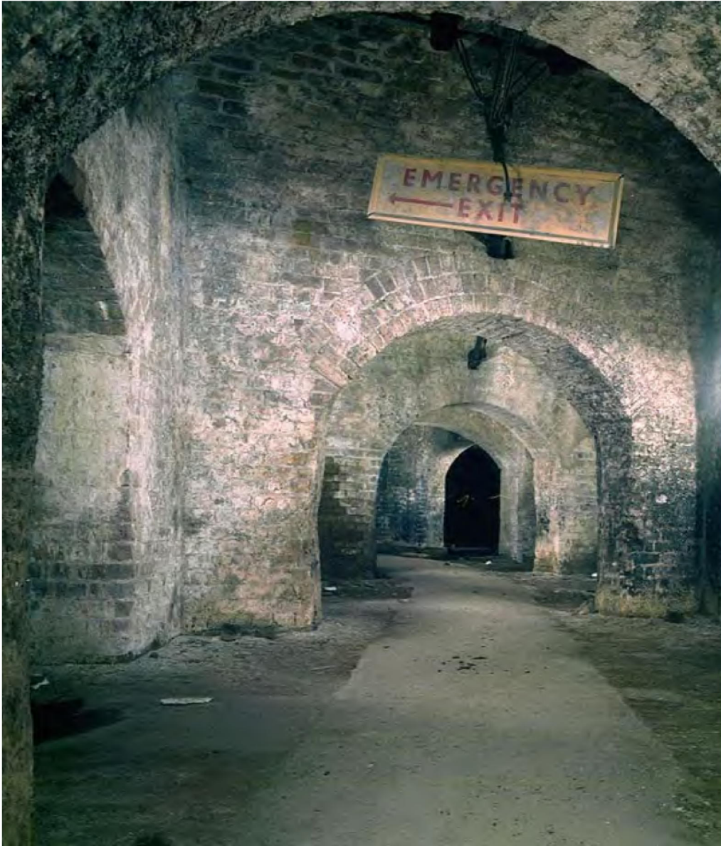
Camden. The Camden Catacombs , as they have become known are were once owned by British Railways but have now passed into multiple ownership. Some sections were demolished during the redevelopment of the area while other sections belong to Camden Market who discourage access.