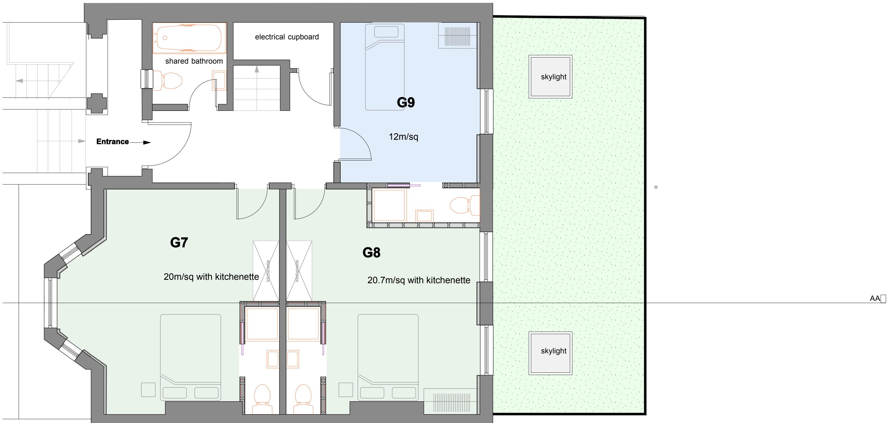
1 101 Proposed ground floor scale 1:50