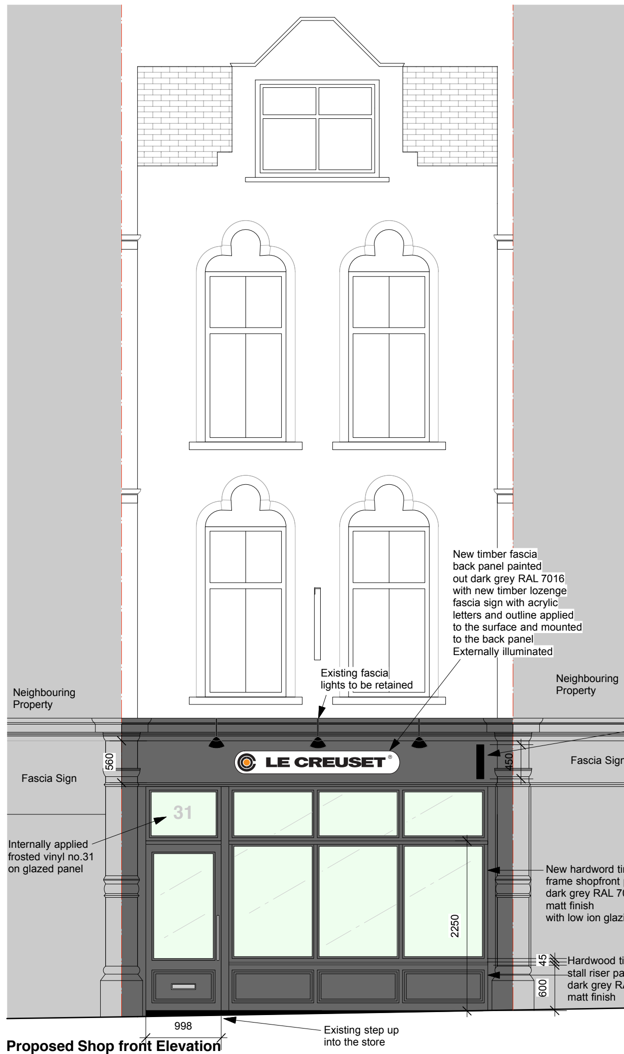
Proposed Shop front Elevation