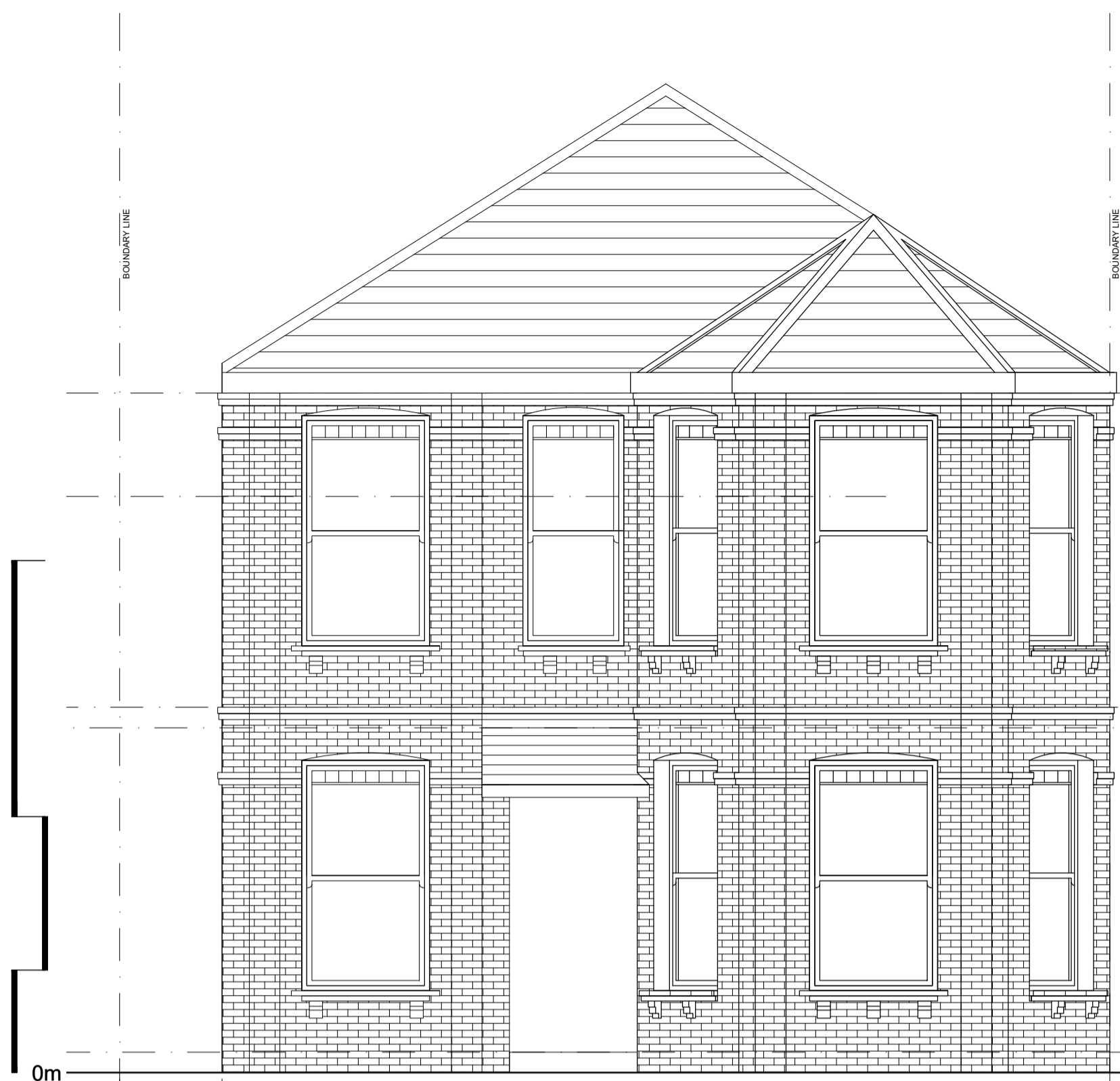
01: EXISTING FRONT ELEVATION SCALE 1:50