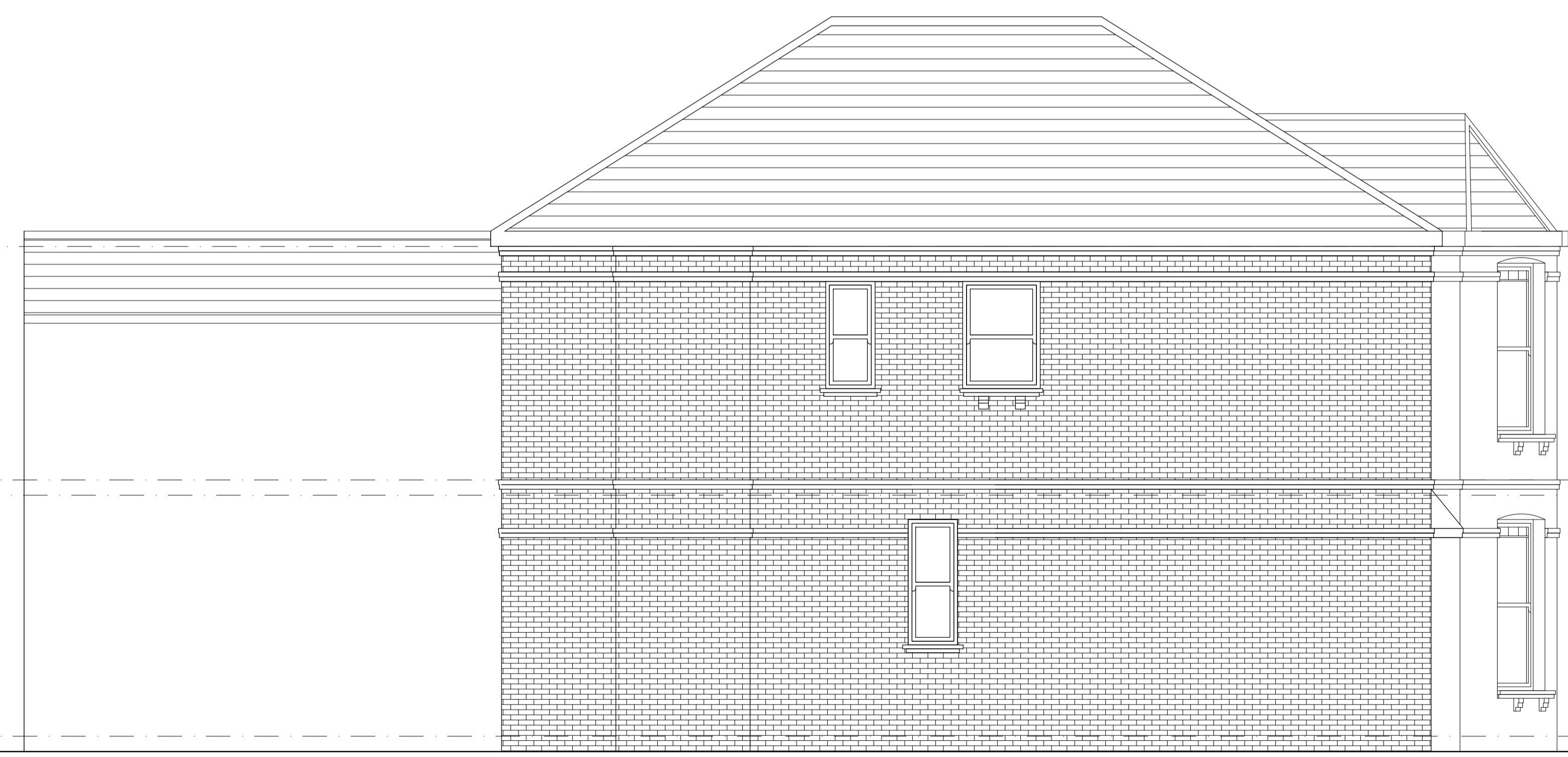
04: EXISTING SIDE ELEVATION SCALE 1:50