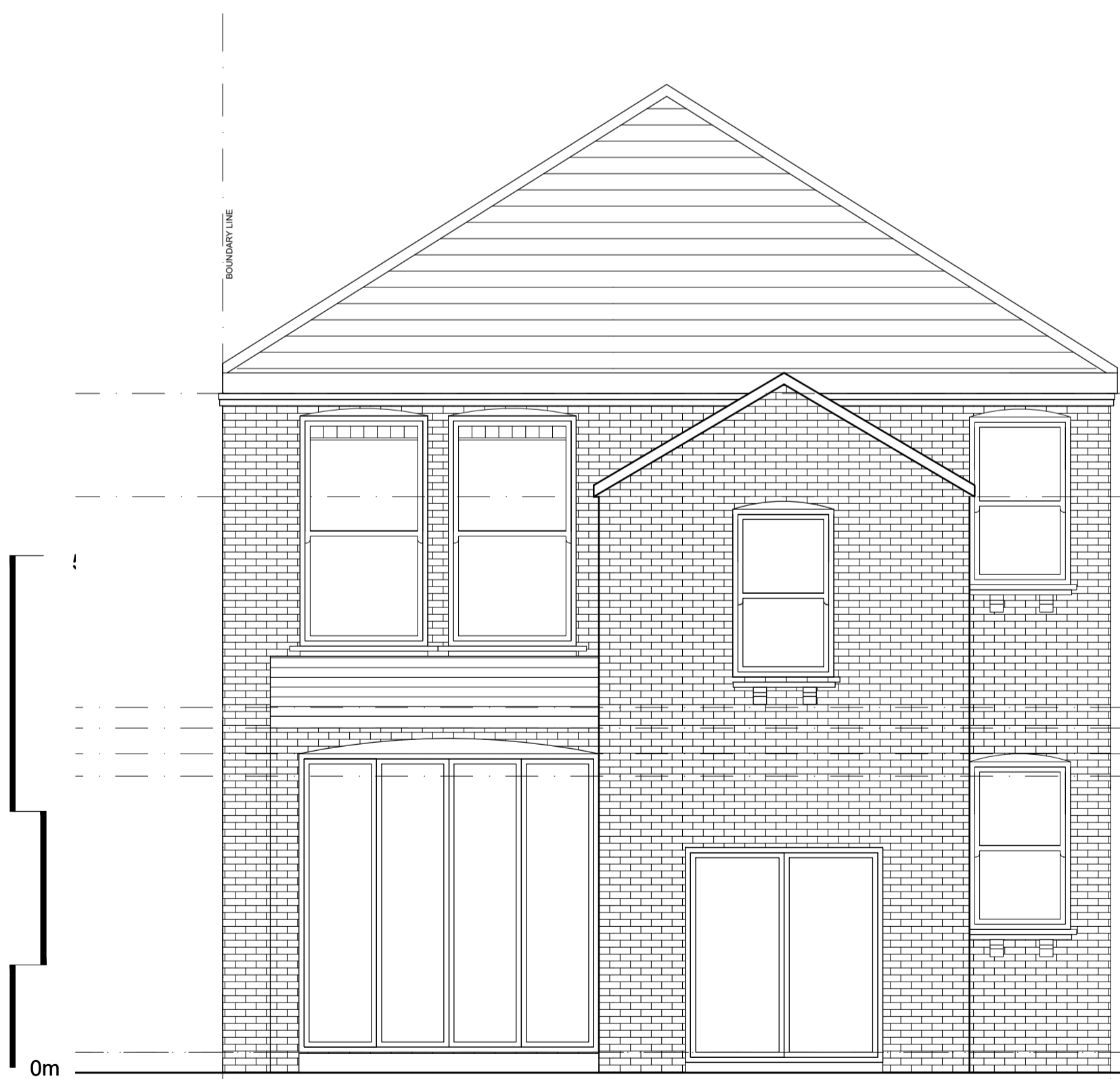
03: EXISTING REAR ELEVATION SCALE 1:50

LOFT FLOOR AREA: 40.3 m 2 DORMER AREA: 19.98 m 3