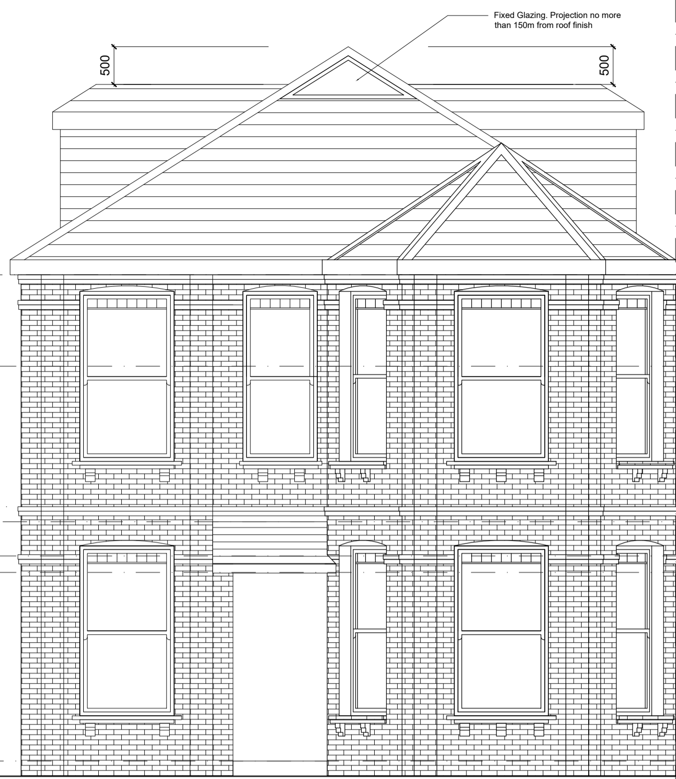
01: PROPOSED FRONT ELEVATION SCALE 1:50

LOFT FLOOR AREA: 40.3 m 2 DORMER AREA: 19.98 m 3