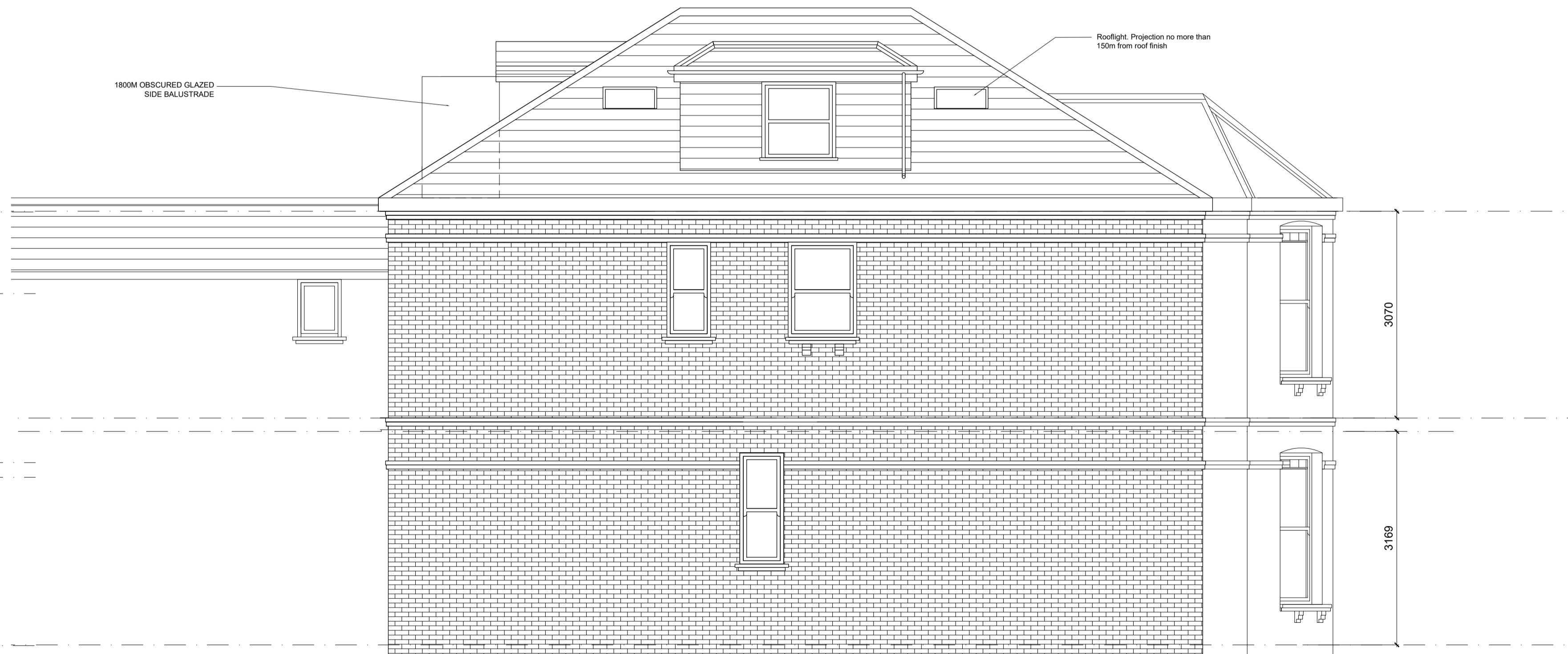
04: PROPOSED SIDE ELEVATION SCALE 1:50