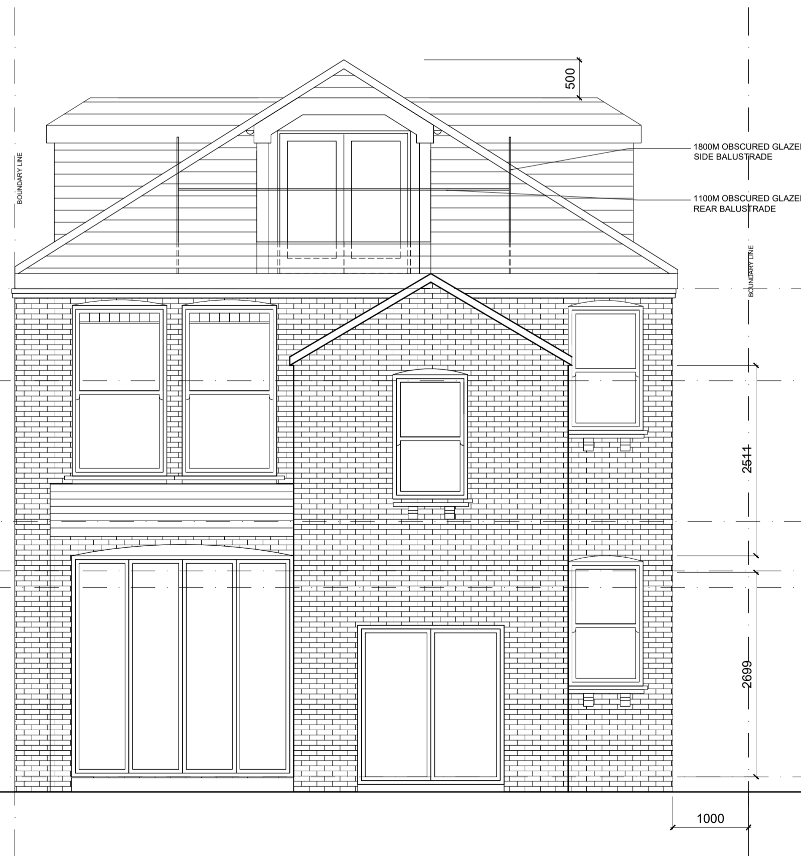
03: PROPOSED REAR ELEVATION SCALE 1:50