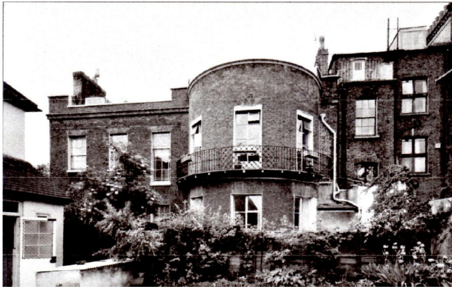
Figure 4. Rear view from the east, Grove End House 1965

The applicants' proposal is to replace the mansard with a set-back brick façade, which would be considerably higher, and therefore more prominent, than the existing mansard slope. The photograph, in Figure 4, of the rear elevation of Grove End House before the addition of the mansard roof shows that originally the scale of buildings stepped down from Cumberland Villa to the right to Grove End House in the centre to 1 Chetwynd Villas on the left. This progression has already been modified by the addition of the second floor on Grove End House. The replacement of the existing mansard roof with a much higher vertical set-back brick façade plus an additional third floor attic would create an even more sudden change in scale between Grove End House and Chetwynd Villas.