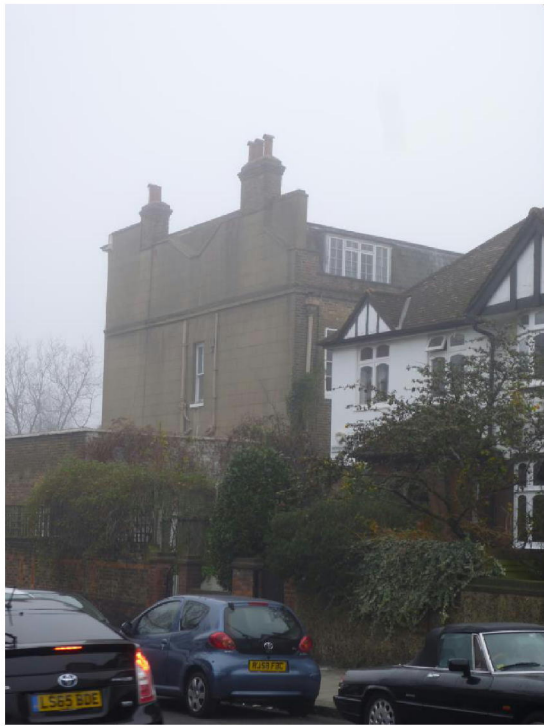
Figure 6. South elevation of Grove End House as existing