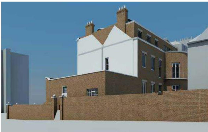
Figure 7. Proposed View of Grove End House from Chetwynd Road.