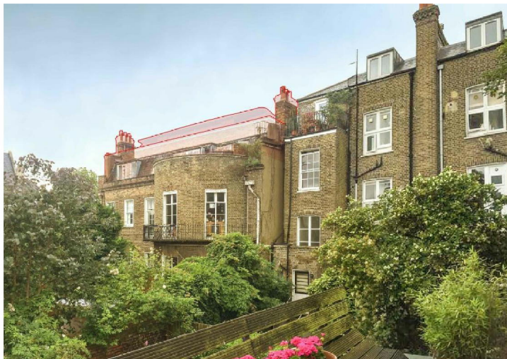
Figure 1 Photographs showing, above, the view of the rear of Grove End House from the terrace of First House Dartmouth Park Road with, below, the same view with the area of sky that would be cut off by the proposed development marked up.

The applicants state that "the main item of new work is an attic storey that is inspired by the original forms of the roofs and the work of Sir John Soane" . However elevated the inspiration and the intention, at the end of the day the result can only be judged on the evidence of the end result. The view of the proposed attic storey in Figure 2 clearly shows that it would not enhance the listed Grove End House. The design of the proposed new extension is in a style wholly unrelated to the classical regency style of the existing building, both visually and in terms of its construction technology. With