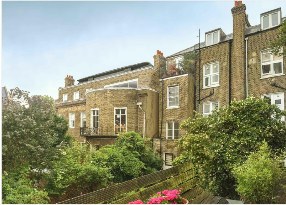
Figure 2. View of the rear of Grove End House as proposed.

its dark grey finishes and curving forms it would provide a dramatic and incongruous contrast to the existing building.