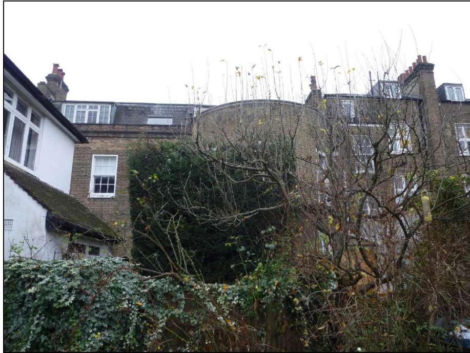
Figure 5. Rear view from the east, Grove End House, 2016.

The problem here is not the existing second floor mansard roof which is entirely appropriate architecturally. The addition of a new third floor on top of the building would be a problem, however, because as the applicants' drawings demonstrate, this would create a top heavy elevation in which the stepping back second and third floors would compete in scale with the original ground and first floors.