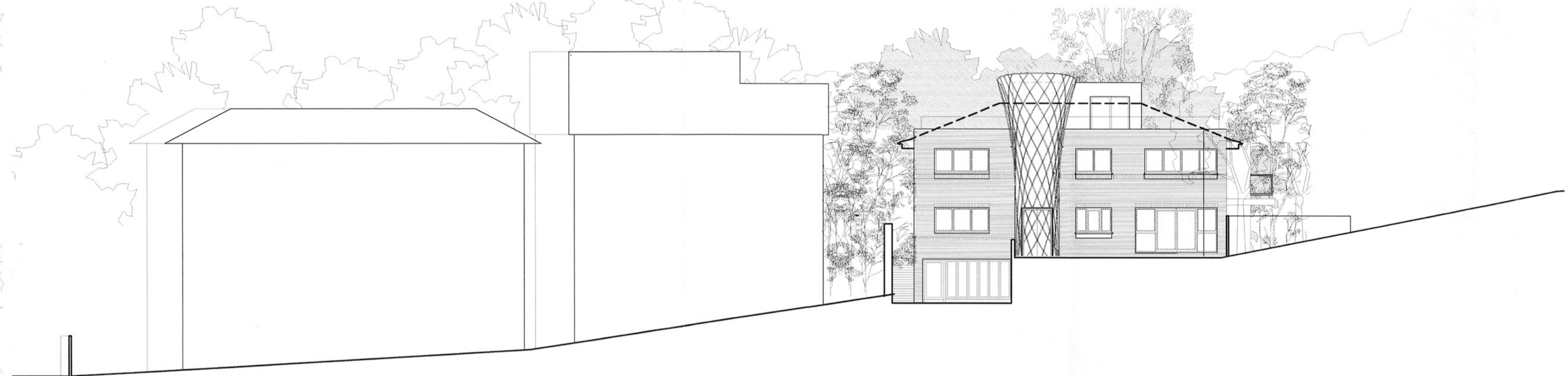
SECTION BB SCALE 1 : 200 @ A1