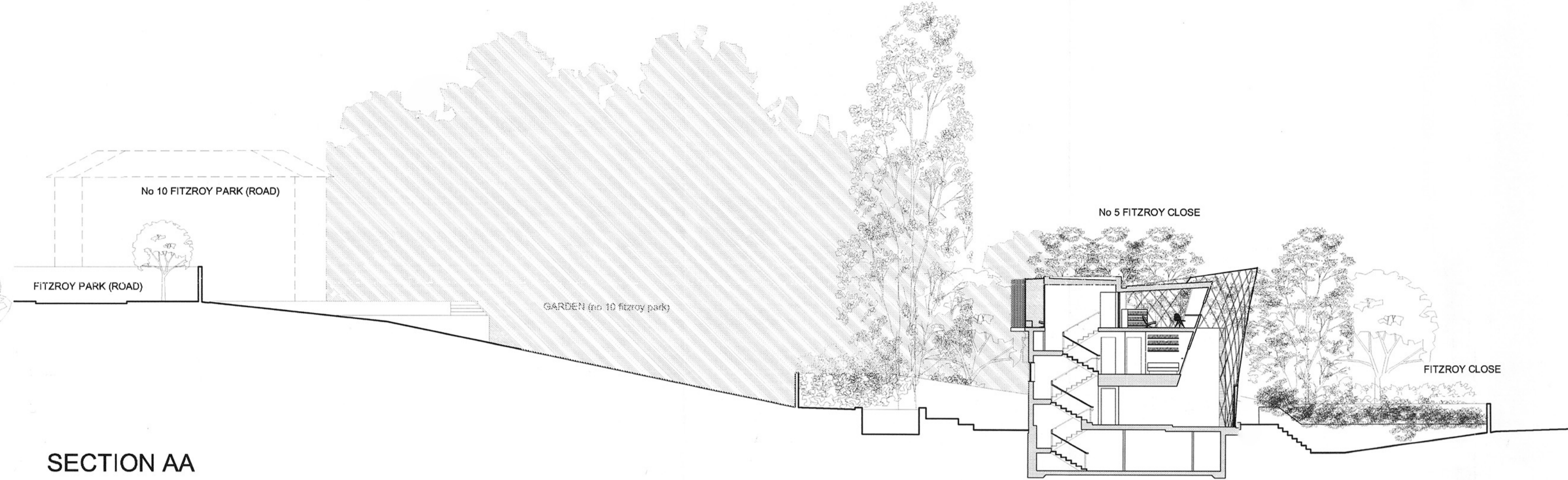
SECTION AA SCALE 1 : 200 @ A1