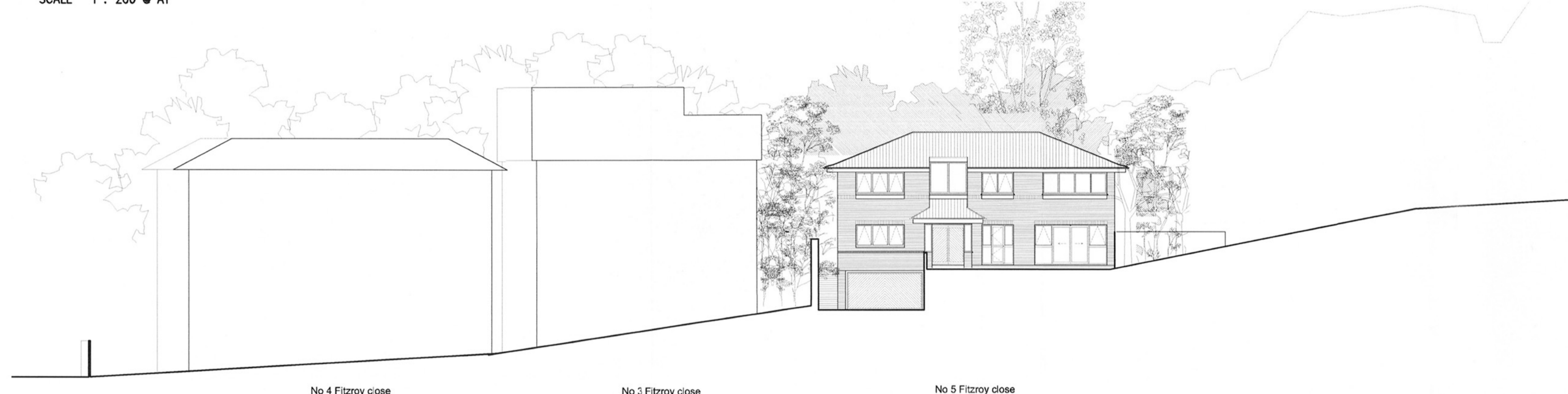
SECTION BB SCALE 1 : 200 @ A1