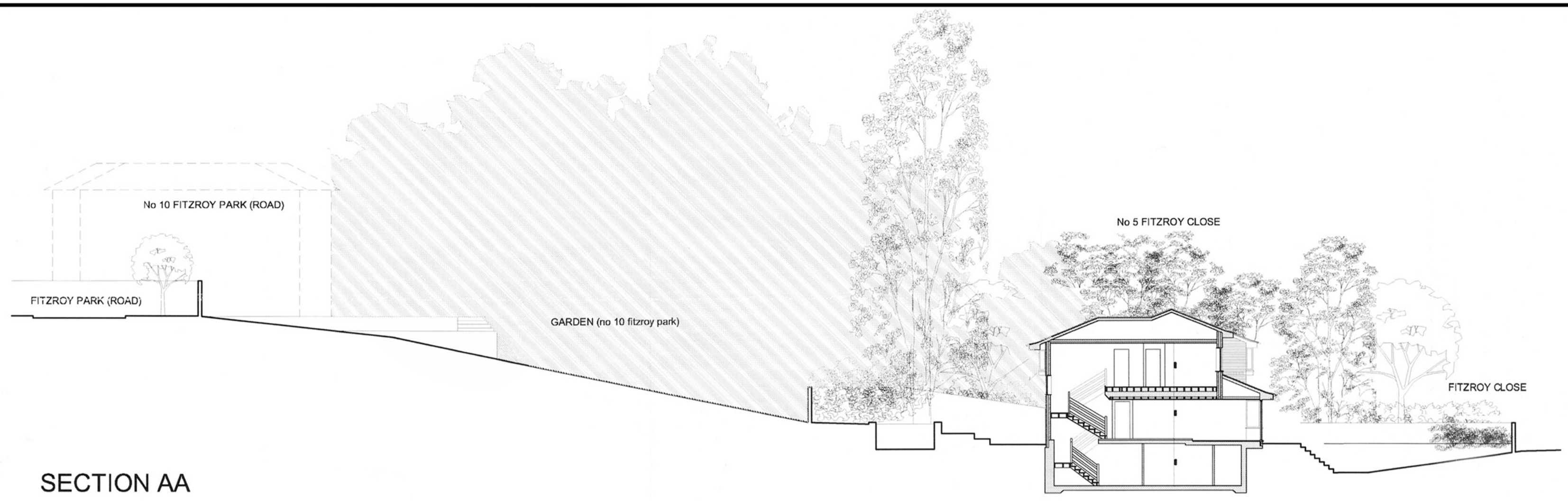
SECTION AA SCALE 1 : 200 @ A1