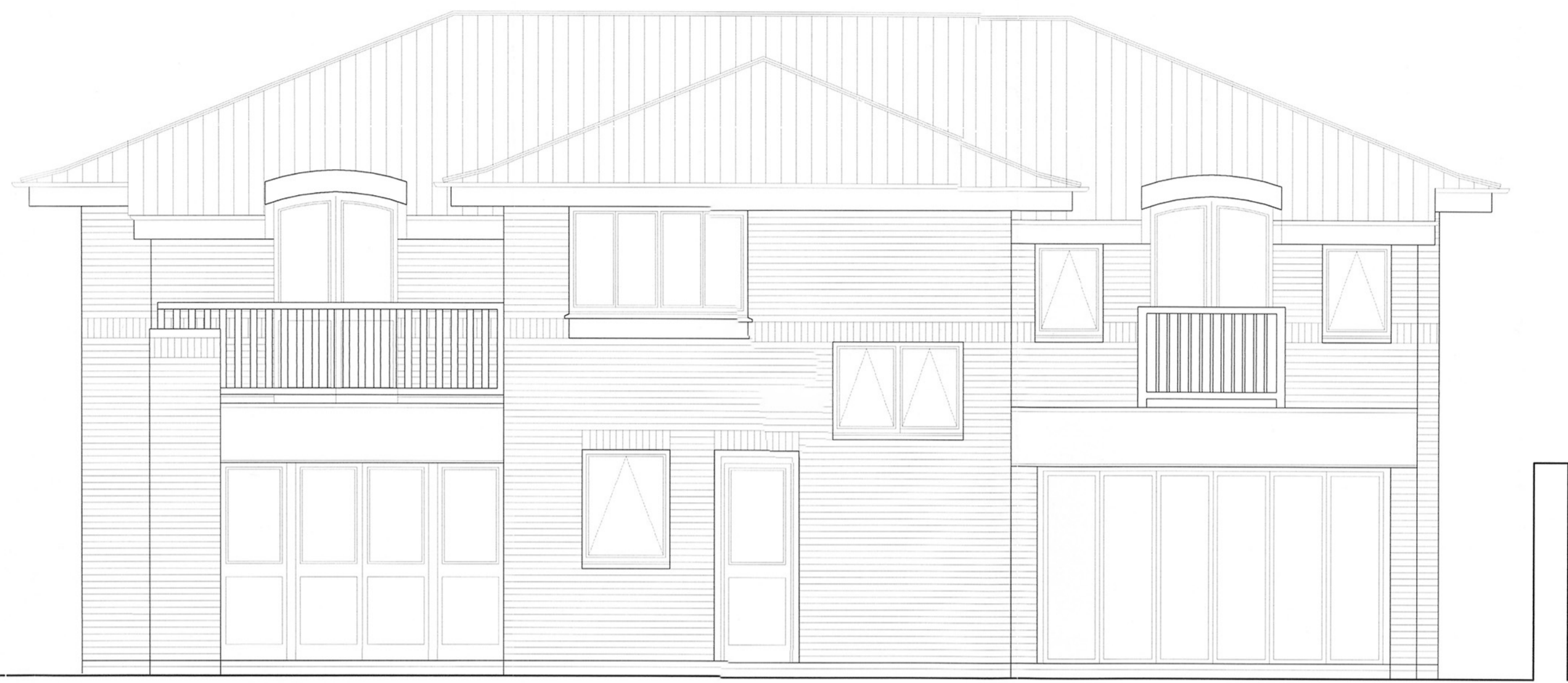
NORTH ELEVATION SCALE 1 : 50 @ A1