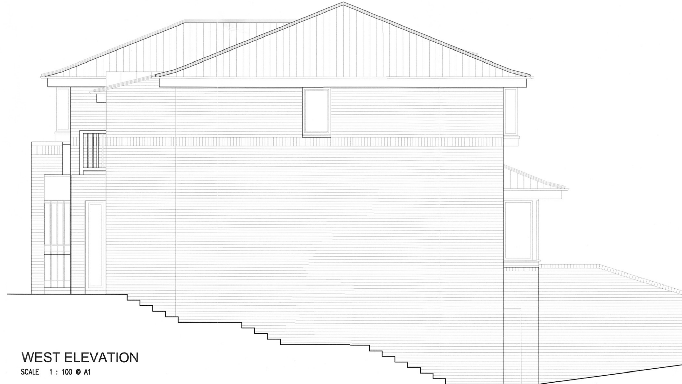
WEST ELEVATION SCALE 1 : 100 @ A1