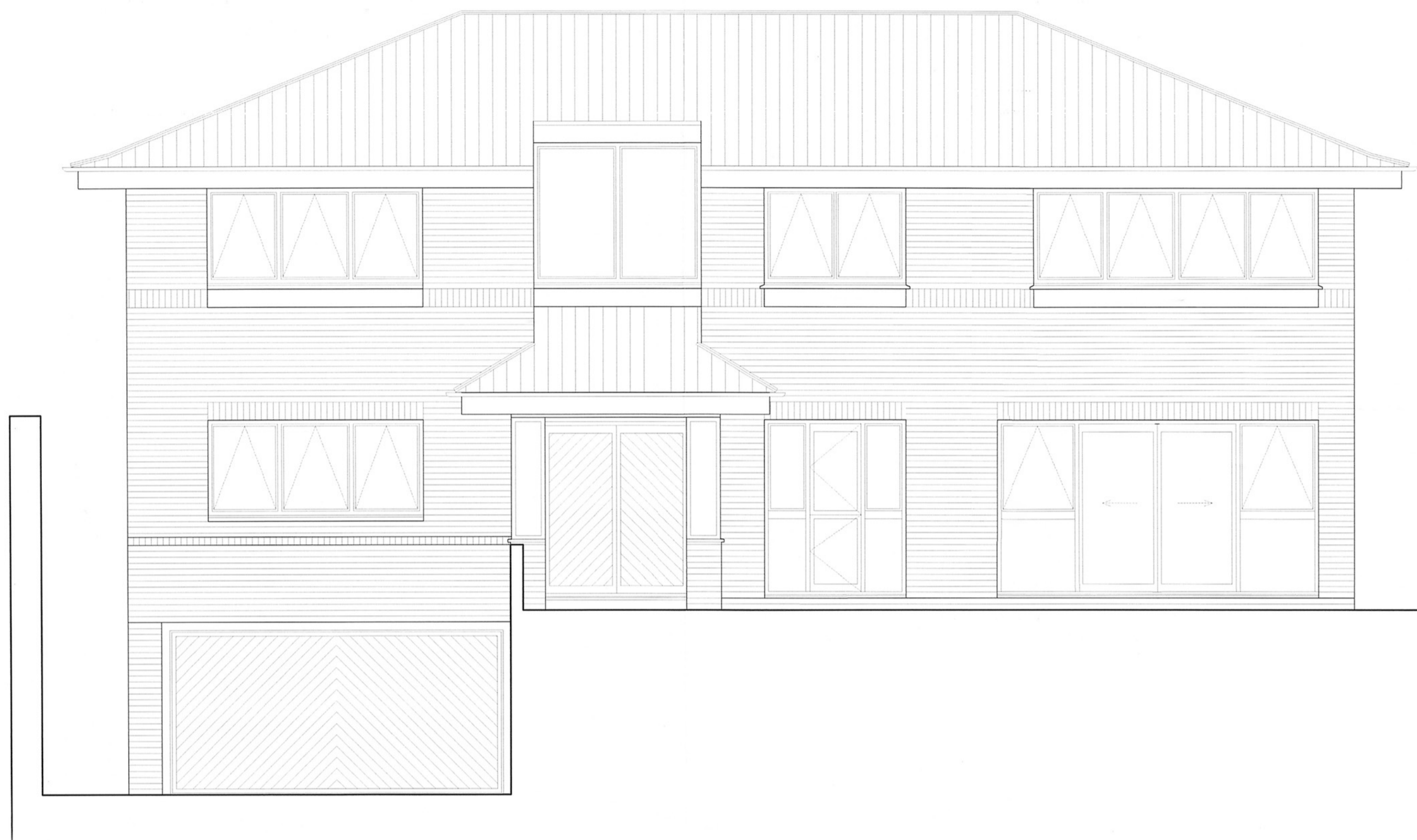
SOUTH ELEVATION SCALE 1 : 50 @ A1

USE FIGURED DIMENSIONS ONLY DO NOT SCALE FROM THIS DRAWING ALL DIMENSIONS MUST BE CHECKED ON SITE ANY INCONSISTENCIES MUST BE REPORTED BACK TO THE ARCHITECT THIS DRAWING AND ANY DESIGNS INDICATED THEREON ARE THE COPYRIGHT OF BROOKS, MURRAY ARCHITECTS ALL RIGHTS ARE RESERVED. NO PART OF THIS WORK MAY BE PRODUCED WITHOUT PRIOR PERMISSION IN WRITING FROM BROOKS, MURRAY ARCHITECTS