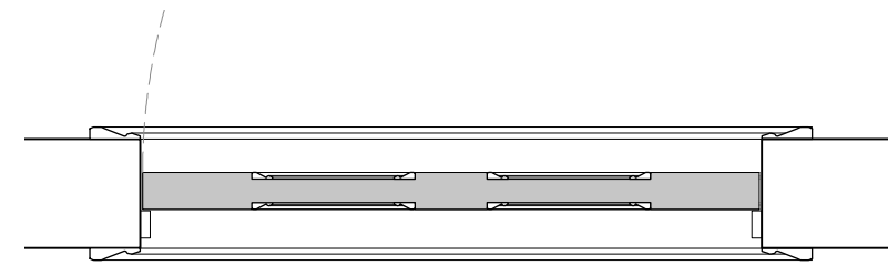
3 PROPOSED TYPICAL DOOR LEAF PLAN Scale: 1:10